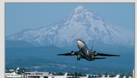
Airliner taking off from Portland International Airport with Mount Hood Volcano, 35 miles to the east, looming above the landscape. This active volcano last erupted about 200 years ago. Volcanic ash clouds from an explosive eruption of Mount Hood could create a major hazard for jet aircraft. (Photo courtesy of Port of Portland.)

Large plumes or clouds of volcanic ash from an erupting volcano can make a local problem a national or an international concern. This is especially true for aviation, because ingesting ash can cause jet engines to fail in flight. This image taken from the International Space Station in 2002 shows an eruption plume extending hundreds of miles downwind from Mount Etna, Italy (photo courtesy of NASA). Insets show a closeup of volcanic ash (top) and a view of an ash particle magnified about 200 times (bottom).