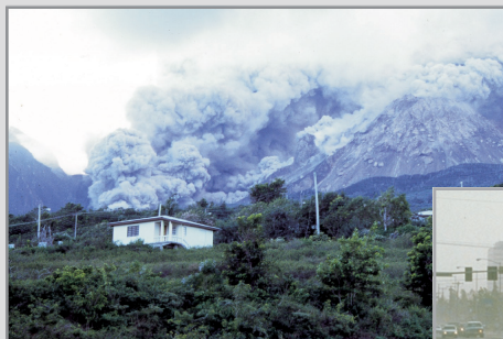
Pyroclastic flows (high-speed avalanches of hot volcanic ash and gases)—a potential hazard at many active U.S. volcanoes—race down the flanks of Soufriere Hills Volcano, Montserrat, British West Indies, during an eruption in 1997.