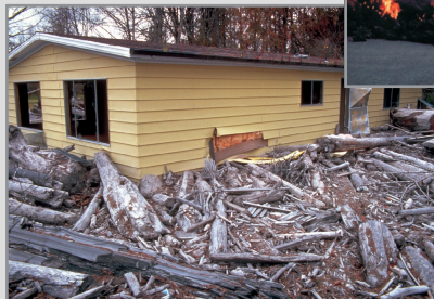
House damaged by debris from a lahar (volcanic mudflow) during the May 18, 1980, eruption of Mount St. Helens, Washington.