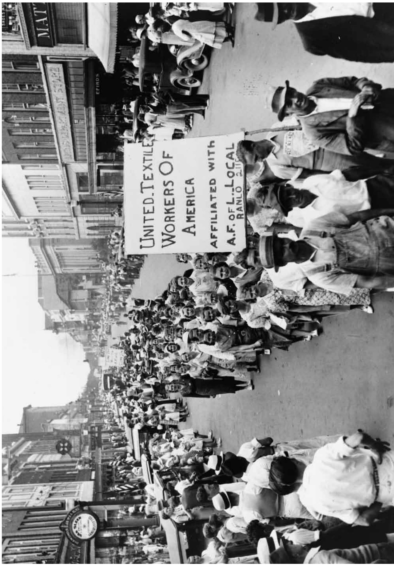
Striking textile workers participate in a Labor Day parade in Gastonia, North Carolina, 1934.