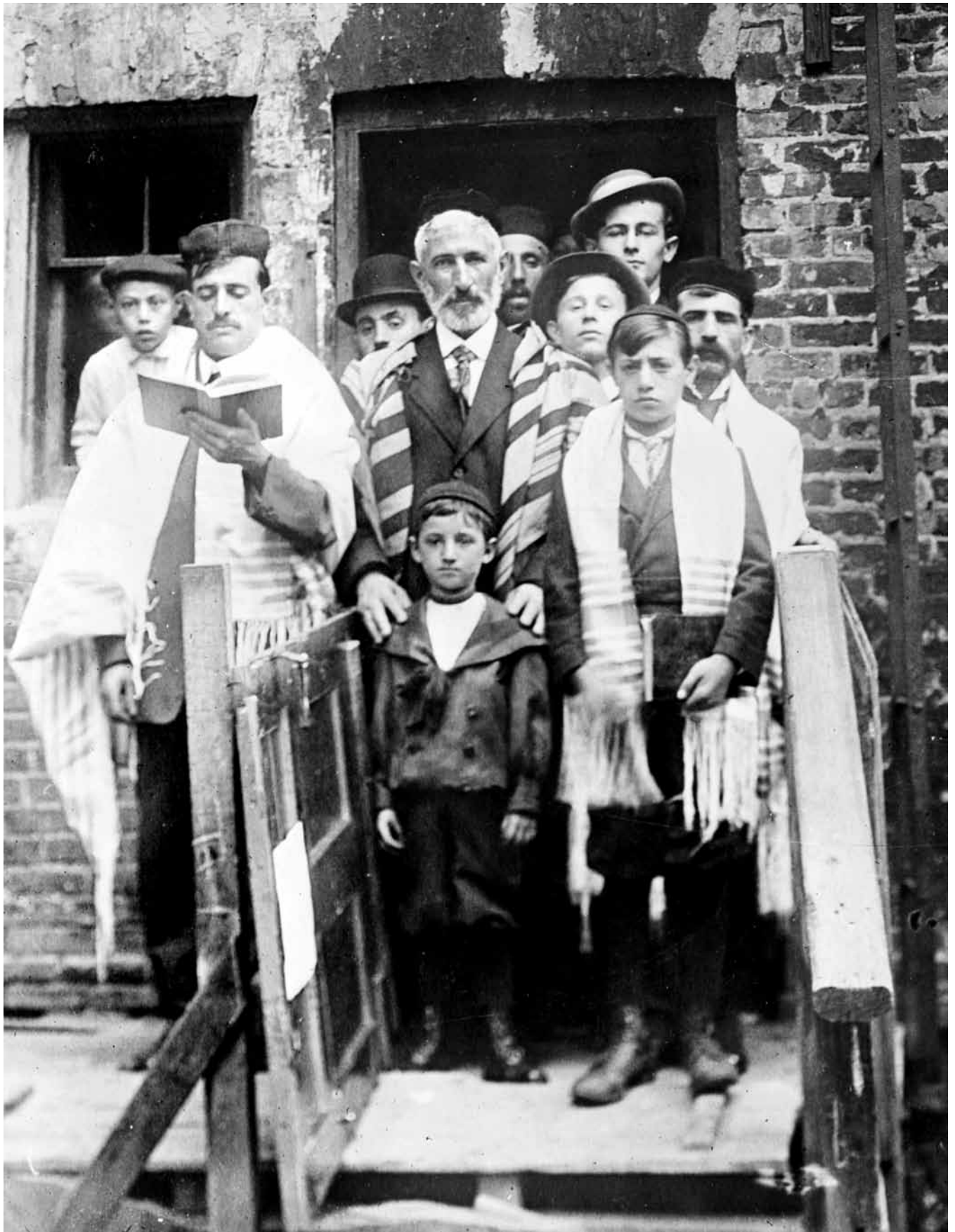
A synagogue on Yom Kippur, circa 1900. Courtesy of the Library of Congress, LC-DIG-ggbain-02316.