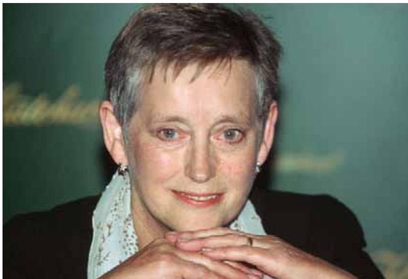
In December 1991 Stella Rimington became the first spy chief to be publicly named; the first to pose openly for cameras; and the first to publish a brochure.

Published fitfully between 1979 and 1990, the five volumes produced by Hinsley and his assistants were a monument to the triumph, but also to the inherent problems of intelli-