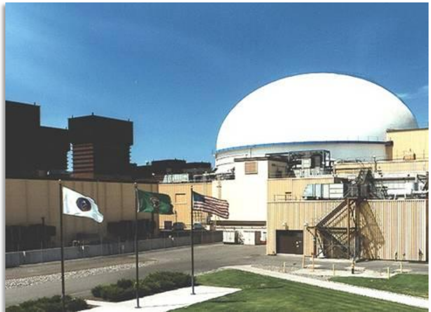
Fast Flux Test Facility