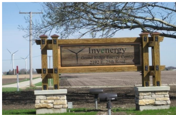
OIG Photograph (April 5, 2010)

Invenergy Wind, LLC (Invenergy) developed the Grand Ridge Energy III wind farm property located in LaSalle County, Illinois, approximately 80 miles southwest of Chicago, Illinois. The subject