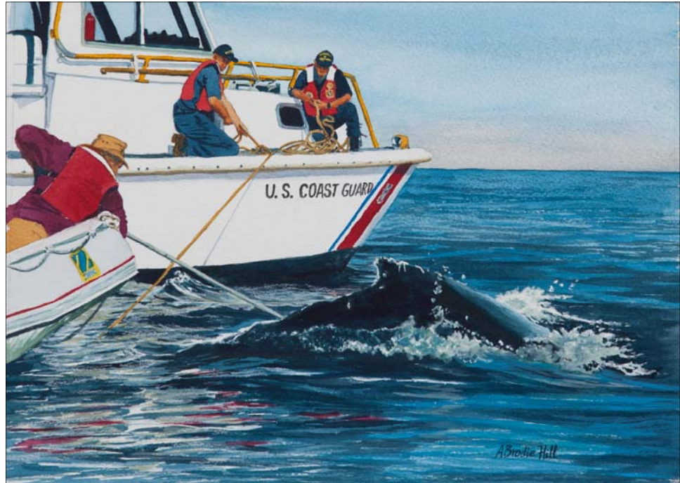
Entangled humpback release Anne Brodie Hill Gainesville, Ga. Watercolor 9 x 12.5

Crew aboard a 41-foot utility boat from Coast Guard Station Southwest Harbor, Maine, assists a scientist in the release of a humpback whale entangled in a lobster trap. Considered endangered marine mammals, these whales are estimated to number only 10,000 to 15,000 worldwide.