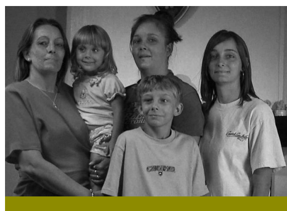
Second Chances and Safer Communities