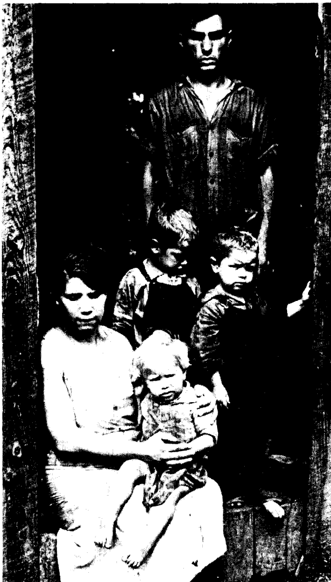
Unemployment affected many families during the Great Depression of the 1930's

Even as the Social Security legislation moved through the Congress in the late winter and spring of 1935, it was acknowledged by many supporters that the old-age program then under consideration was but a first step in providing comprehensive protection for American workers