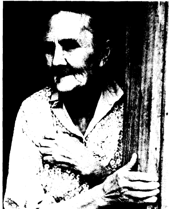
Before Social Security, many people faced destitution in old age

before. By 1932, however, unemployment reached 34 percent of the nonagricultural workforce. Between 1929 and 1932, national income dropped by 43 percent, per capita income by 19 percent. By the mid-1930's, the lifetime savings of millions of people had been wiped out.