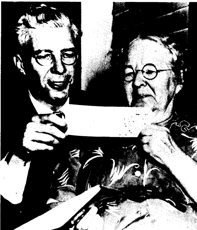
Ida Mae Fuller, who became Social Security's first beneficiary in 1940

As a Nation, we can take particular pride in having made the Social Security program the most successful domestic program in our history. Over the years, Social Security has been a vital contributor to the security of virtually all Americans. Today, 50 years after its inception, it remains the foundation of well-being for us in our later years or if we are disabled and for our families if we die before retirement.