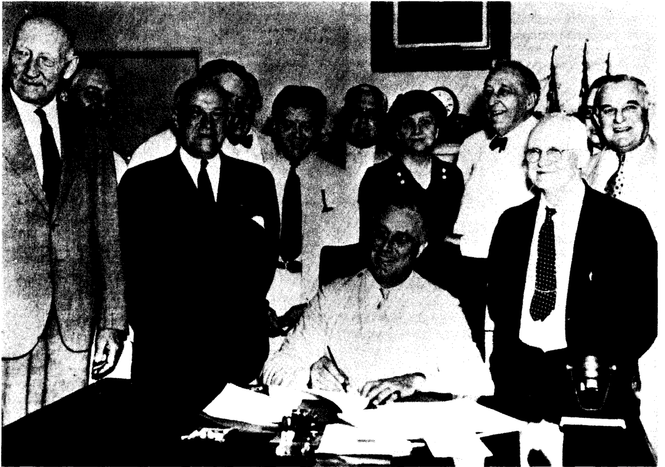
August 14, 1935—President Roosevelt signs the Social Security Bill into law