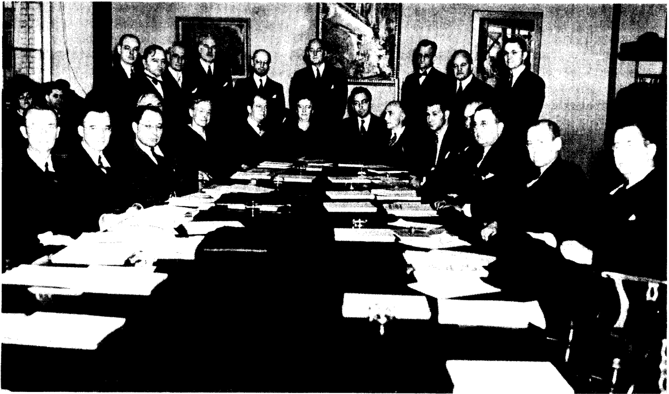
The Advisory Council on Social Security, 1937-38

for the Social Security system, the Senate Committee on Finance said in its report of the 1950 amendments: