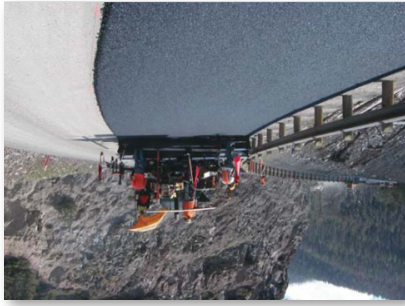
Warm Mix Asphalt