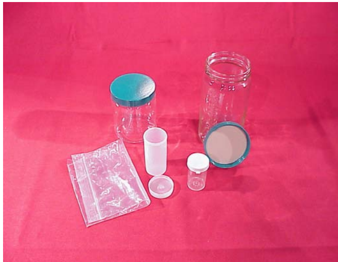
Figure 14-3. Bulk Sample Containers