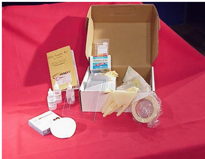
Figure 14-1. Wipe Sampling Kit