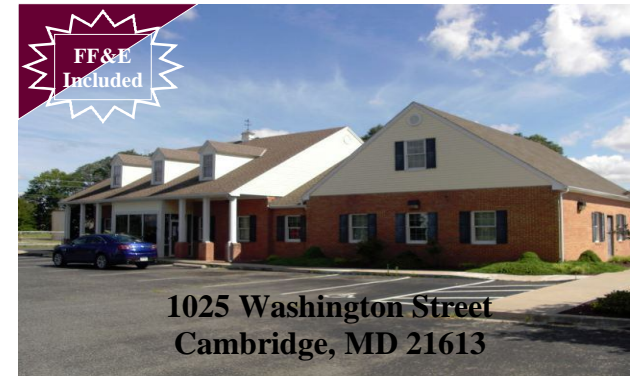
1025 Washington Street Cambridge, MD 21613