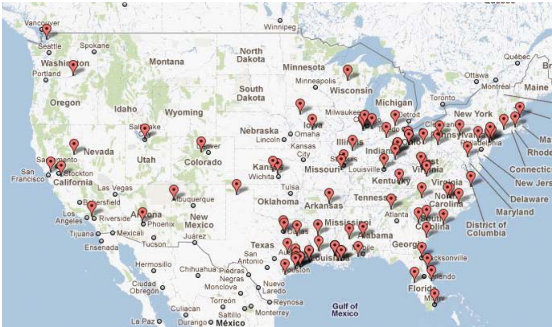
FIGURE 1 CSB completed investigations since 1998

spaces with hazardous atmospheres. In addition, international stakeholders have benefited from lessons learned from U.S. domestic incidents: our recommendations on industry best practices have been adopted in numerous countries over the past decade and have resulted in improved worldwide process safety knowledge. In fact, the CSB’s investigative reports and safety videos are used extensively around the world, especially in countries with a significant chemical and oil industry presence. The CSB receives