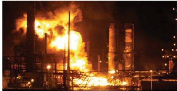
Liquefied petroleum gas fire at Valero's Mckee Refinery near Sunray, TX, February 16, 2007

GOAL 3: Preserve the public trust by maintaining and improving organizational excellence.