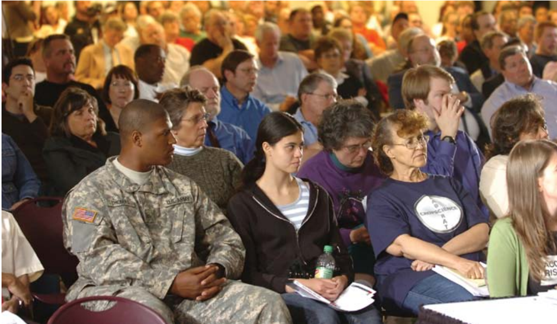
The CSB's 2009 public meeting in Institute, WV, to release preliminary findings on the board's investigation into the fire and explosion that fatally injured two workers at the Bayer CropScience facility in Institute, WV.