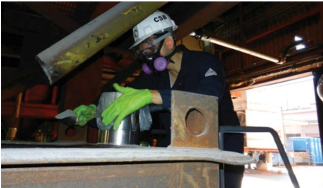
CSB investigator collects dust samples from a Hoeganaes facility in Gallatin, TN, which experienced multiple iron dust flash fires during a six month period in 2011.