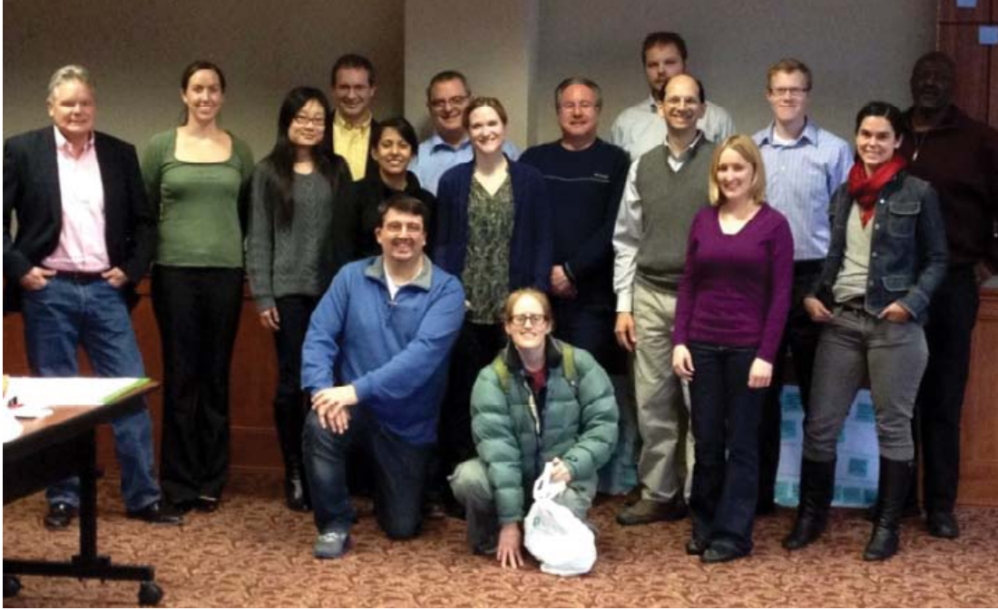
CSB investigation and recommendations staff at a training session

Denver offices. CSB is also working towards incorporating its administrative records into its electronic records management system. Finally, the agency has procured SharePoint, a collaborative platform with user friendly dashboard interfaces that enable web-based sharing of items such as calendars and documents, that will be implemented in the coming years.