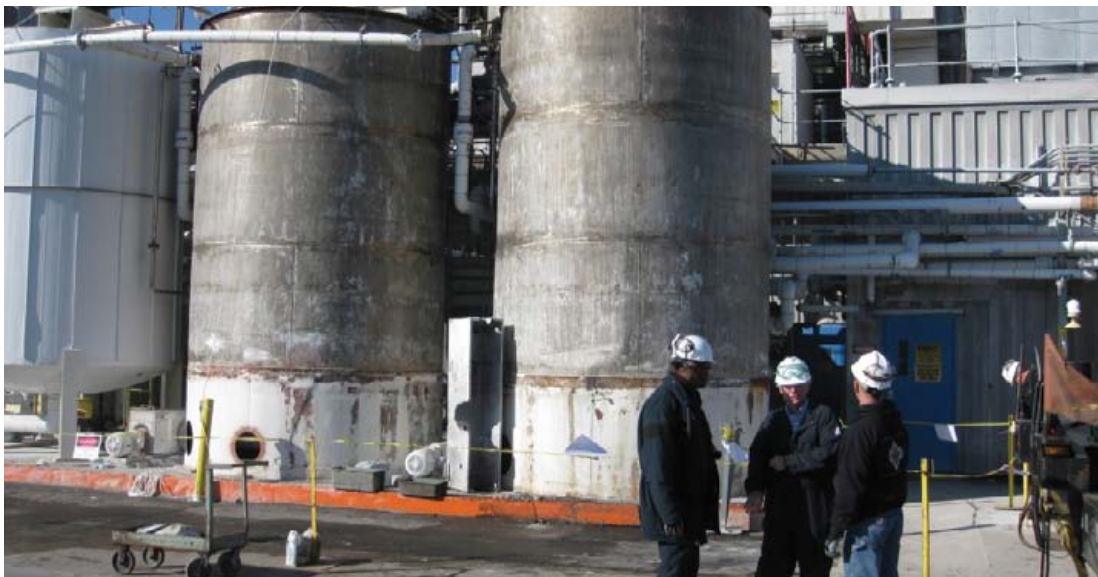
CSB investigators at a DuPont plant after a fatal hotwork explosion in November 2010

The Human Capital Plan also details a number of specific tactics to improve the