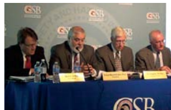
Current members and general counsel of the U.S. Chemical Safety and Hazard Investigation Board (CSB)

workers, the public, and the environment. Since fiscal year 1998, the year CSB