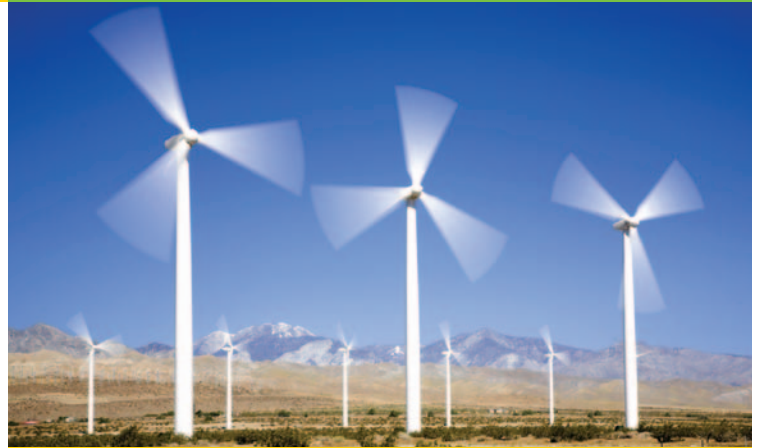
The potential U.S. land-based wind resource is about 10,000,000 megawatts.

The renewable energy industry creates thousands of long-term, high-technology careers in wind turbine component manufacturing, construction and installation, maintenance and operations, legal and marketing services, transportation and logistical services, and more. In 2009 and 2010, the wind sector invested roughly $27 billion in the U.S. economy and employed about 85,000 workers.