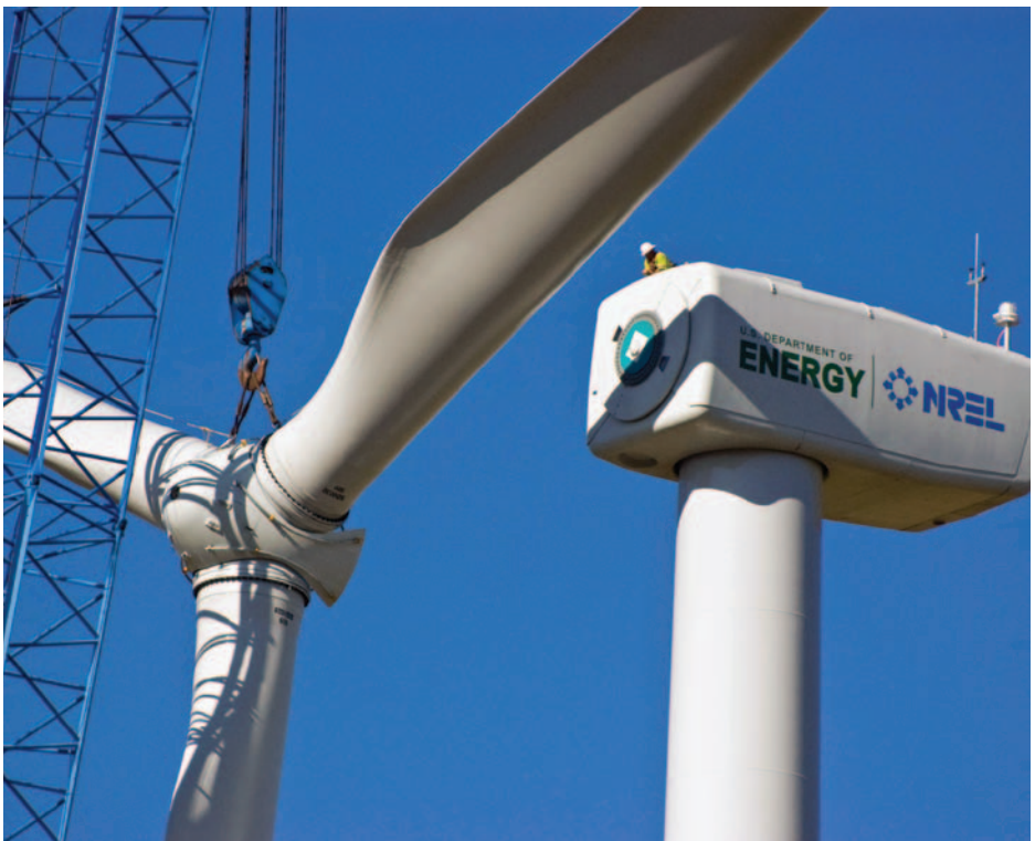
National Renewable Energy Laboratory technicians install DOE's 1.5-megawatt GE wind turbine at the National Wind Technology Center.

development projects with industry to further improve reliability, increase capacity factors, and decrease costs of large wind turbine technology. Current areas of focus include advanced rotor development, gearbox and blade reliability initiatives, design validation and modeling, and component testing.