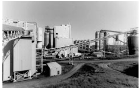
By producing a multiple slate of value-added fuels and other products from coal, the ENCOAL TM plant near Gillette, WY, could be the forerunner of future coal "refineries."

On October 22, 1996, ENCOAL TM Corporation announced that it was beginning the permitting process for a full-scale