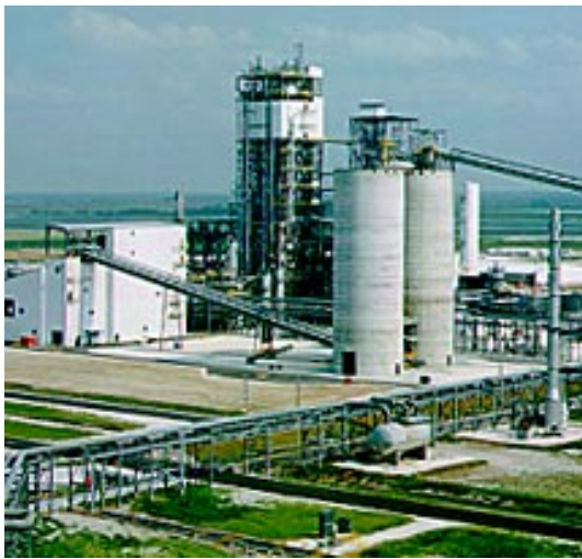
The Tampa Electric Company's pioneering gasification combined cycle facility is one of the cleanest and most efficient coal-fired power plants in the world.

For more than 20 years, utility engineers have envisioned power plants that would substitute coal gasifiers for the traditional boilers....In the 1990s, the drawing board visions became reality.