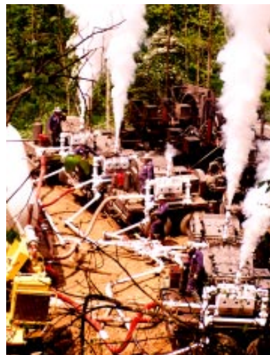
A CO 2 -Sand fracturing operation produces four times the production rates of wells fractured with conventional foam.

During five months of well testing, CER's test well (#1-SHCT) produced over 150 million cubic feet of natural gas including five weeks at a steady rate of 3 million cubic feet per day. A gas deliverability test predicted an "absolute open flow potential" of 19 million cubic feet per day. More importantly, the tests demonstrated that slant hole drilling is commercially viable in tight gas reservoirs since the added drilling expenses were more than offset by the resulting production.