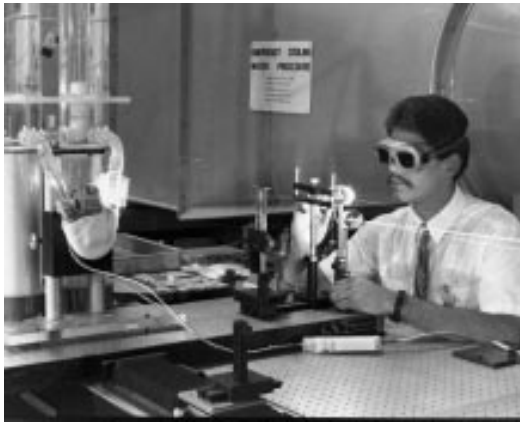
Using laser imaging technology developed for coal slurries, a federal researcher analyzes simulated blood flow through an artificial heart.

S pinoff applications for technologies can rarely be planned and are often the most difficult to track. Yet, spinoffs have been important success stories in the Fossil Energy program. Three of the most prominent are: