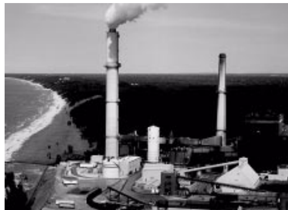
Equipped with the Pure Air advanced desulfurization unit, the Bailly Station on the shores of Lake Michigan is now removing more than 95 percent of the sulfur pollutants from its coal combustion flue gas.

Southern Company Services, in association with Fluor and Chiyoda (the technology owner) is currently building at CT-121 scrubber at a tar sands oil extraction facility in Murray, Alberta Canada. Sized at the equivalent of a 350-MWe power system, the scrubber has an estimated value of $75 million with a U.S. employment impact of 260 job-years.