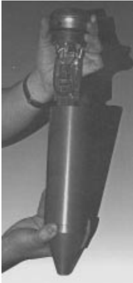
An Automatic Casing Swab