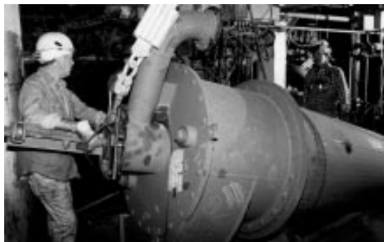
Technicians install an advanced low-NOx burner into a retrofitted boiler at Southern Company Services' Plant Hammond.

Today [utility power] plants have new ways to reduce [NOx] emissions at much lower costs - up to 10 times lower - than the technologies that would have been available without the Federal Government's research investment.