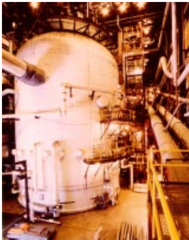
The 70-megawatt Tidd Pressurized Fluidized Bed Combustor pioneered a new, cleaner way to burn coal in utility power plants.

The technology has progressed into larger scale utility applications due, in large part, to Federal partnership programs with industry. The Colorado-Ute Electric Association project in Nucla, CO (now operated by Tri-State Generation and Transmission Association, Inc., of Denver) was one of the early demonstrations in the Clean Coal Technology Program and is responsible for significant design improvements and commercial confidence in this state-of-the-art, low-polluting combustion system. In November 1994, Tri-State Generation and Transmission began repaying the Federal investment in the project, having produced sufficient operating revenues to trigger the recoupment provision of the company's Clean Coal Technology project agreement.