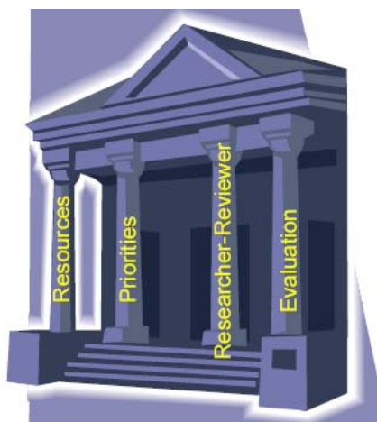
Figure 2. Four Pillars Supporting CBER’s Regulatory Science