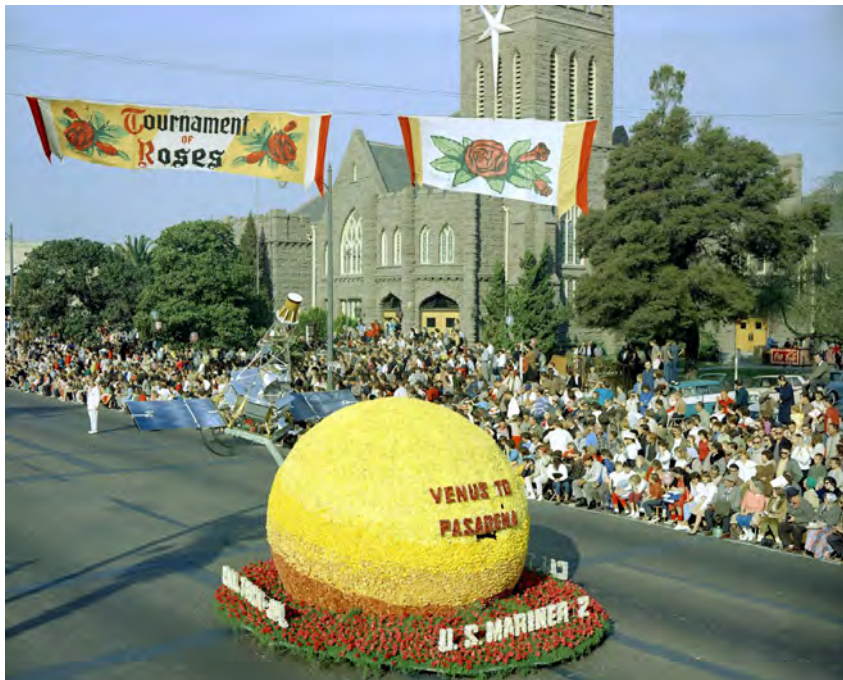
JPL’s 1963 Rose Parade float moving down Colorado Boulevard.