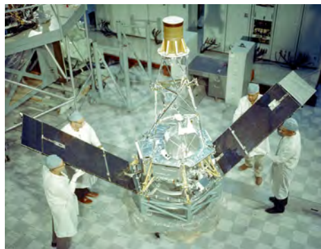
Mariner 2 under construction.