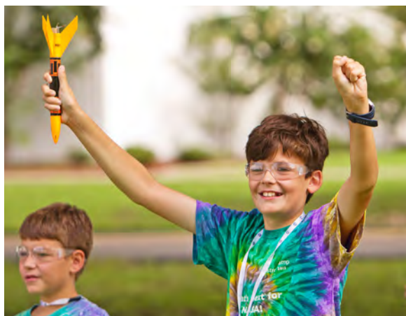
Summer Astro Campers launch Estes Rockets they constructed during a weeklong camp at Stennis Space Center.