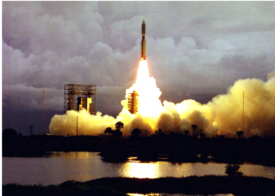
Viking 2 (above) is launched on a Titan-Centaur on 9 September 1975. Viking 1 was launched on 20 August 1975, and both spacecraft reached Mars the following summer.

The Cassini launch brought an end to Glenn's management of NASA's interplanetary launches. NASA decided to consolidate Lewis/Glenn's and Goddard's launch vehicle programs with Kennedy's. During its 35 years in the business, Lewis/Glenn managed the launches of 17 interplanetary missions, 14 lunar vehicles, and scores of satellites.