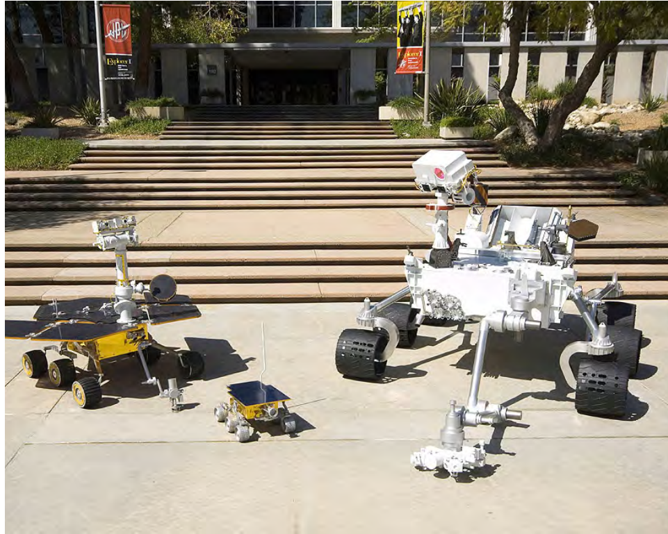
The Mars rovers in a family photo: Mars Science Laboratory's Curiosity rover (right), Mars Exploration Rovers (MERs) Spirit and Opportunity (left, only one pictured), and Mars Pathfinder's Sojourner (center). The rovers have increased in size to carry more scientific instrumentation and travel longer distances.