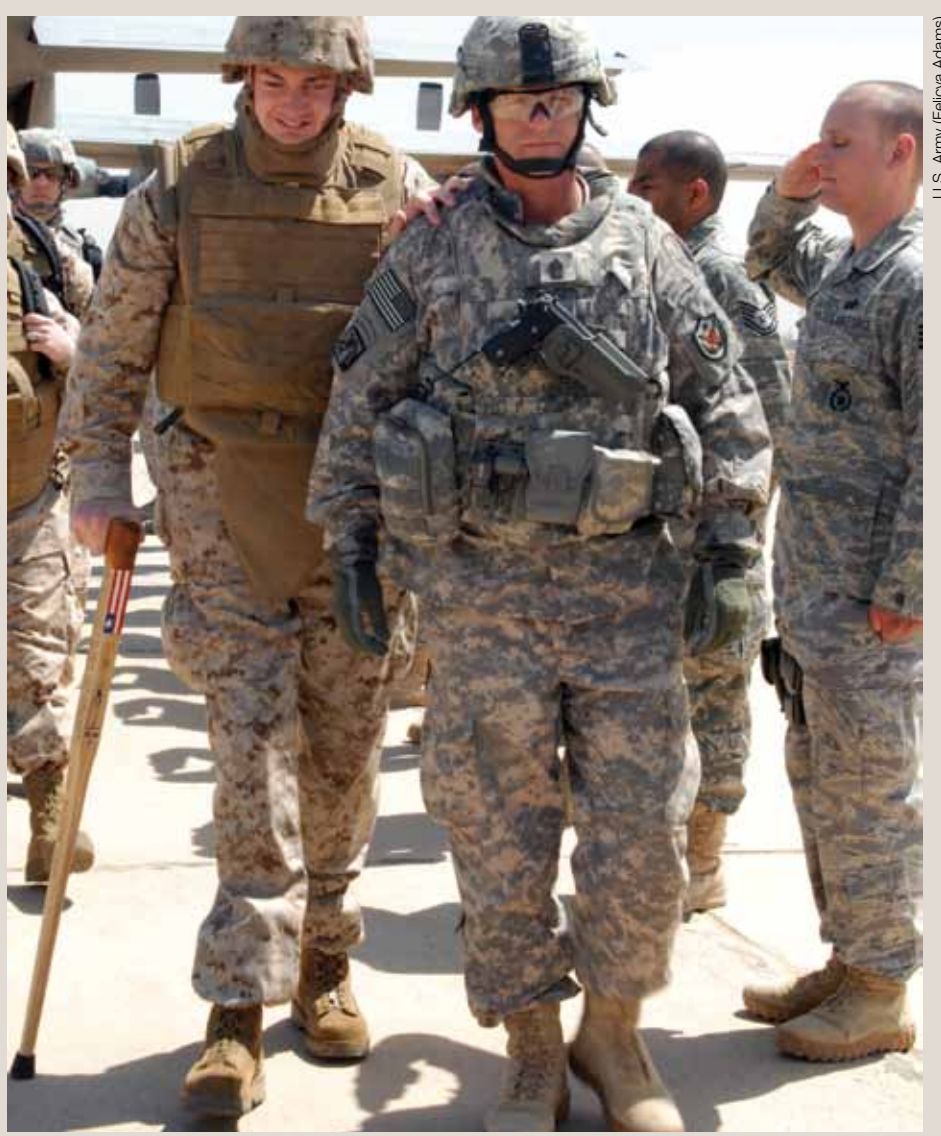
Wounded U.S. warrior boarding C-130 departing Iraq during Operation Proper Exit

ndupress.ndu.edu issue 65, 2<sup>d</sup> quarter 2012 / JFQ 7