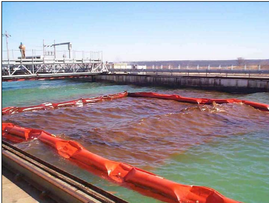
Figure 8. Successful Dispersion, Start of Cresting Wave at Right of Photo

Wave amplitude and period measurements were made during 5 to 10 minutes of each test. These records were analyzed for average wave amplitude and period. The average wave amplitude for the tests ranged between 16.5 and 22.6 cm and the average period was between 1.7 and 1.9 seconds.