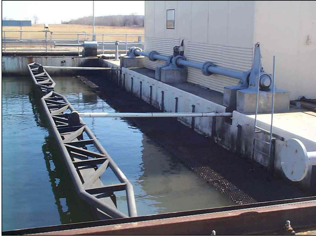
Figure 2. Ohmsett Tank Wave Paddle System