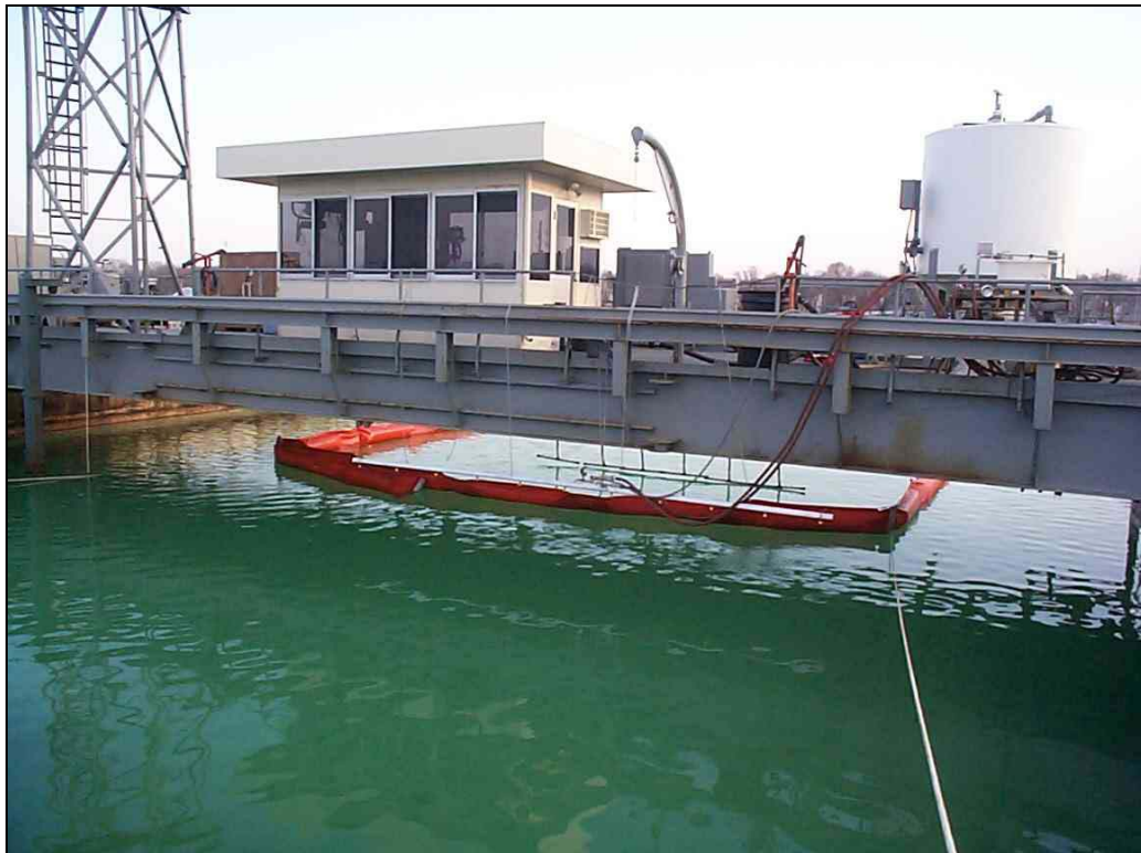
Figure 3. Main Bridge with Dispersant Spray Bar in Foreground, Oil Distribution Behind