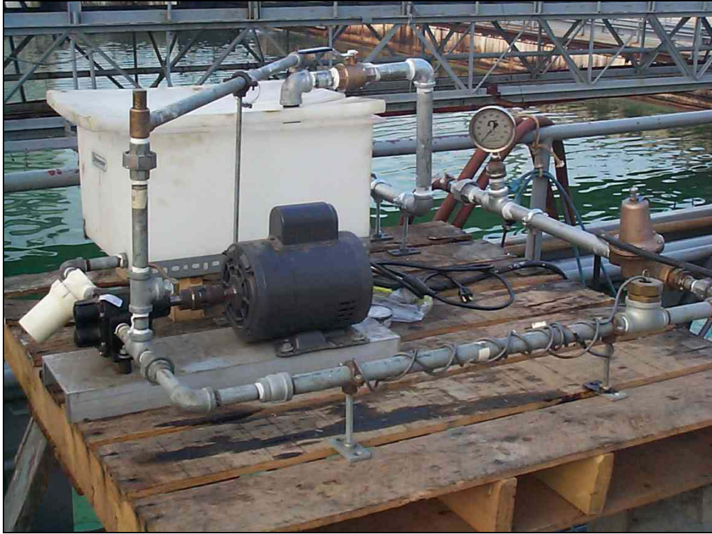
Figure 6. Dispersant Supply Tank and Pump