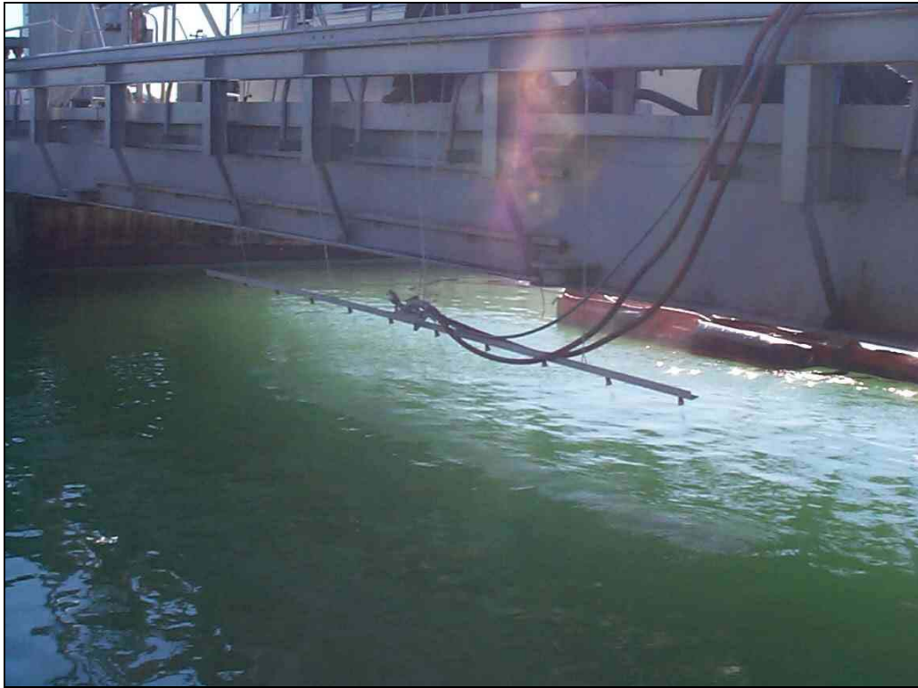
Figure 7. Dispersant Spray Bar in Operation