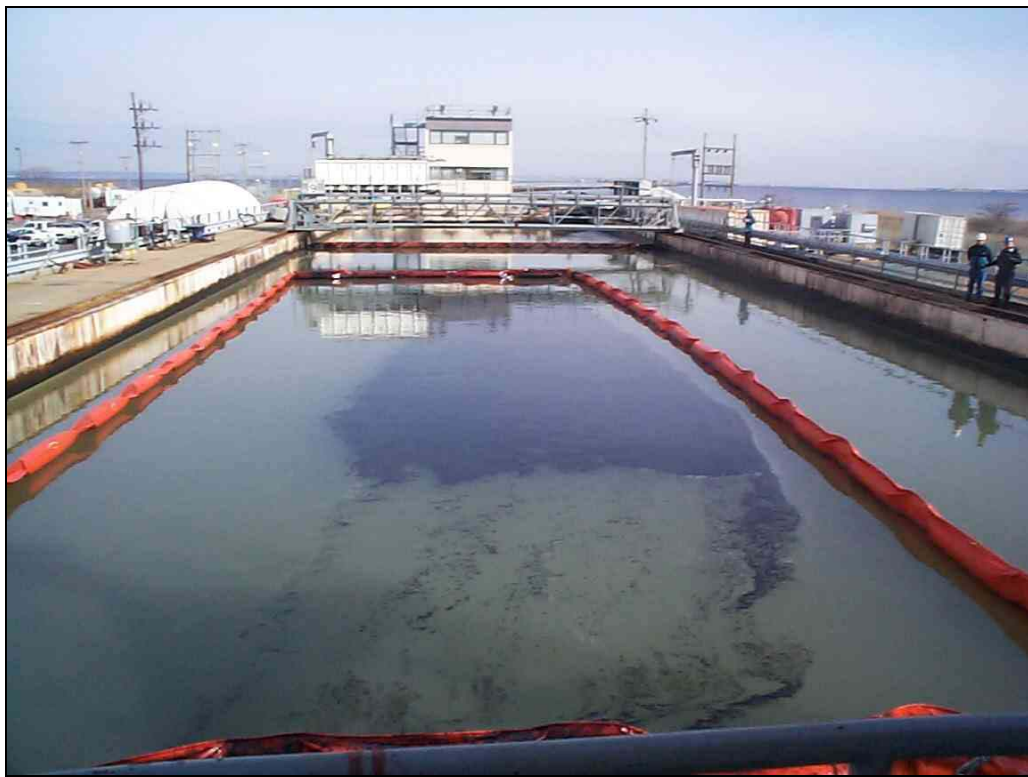
Figure 1. Ohmsett Test Tank with Oil Containment Boom

The main equipment components of the DE test procedure include the Ohmsett tank, the wave making system, the main equipment bridge, the oil distribution system, the oil containment boom and the dispersant spray system. Photos of these components are provided in Figures 1 through 7. Additional details of the equipment and methods used can be found in SL Ross 2000b.