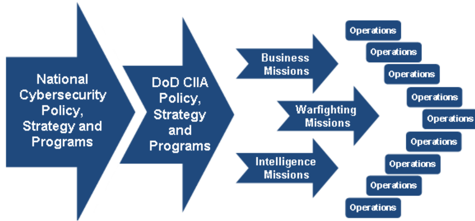
Figure 2. DoD CIIA Strategy Implements National Policy and Strategy and Supports all DoD Missions and Operations

Its contents should be referenced and incorporated into DoD Component and CPM) plans that impact CIIA capabilities. It updates and replaces the DoD 2004 Information Assurance Strategic Plan and all interim updates, and reinforces the critical contribution of the CIIA community in making DoD networks, information and information technologies secure, available, and sound for purpose. It implements national cybersecurity policy and strategy, helps shape National and global cybersecurity markets and technology pipelines, and it supports the full IM/IT life cycle across all defense business, intelligence and warfighting missions and operations, as illustrated in Figure 2.