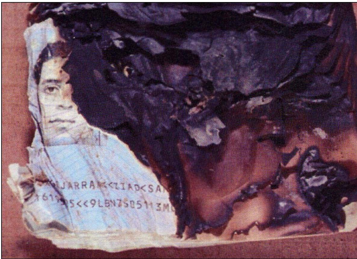
A partly-burned copy of Ziad Jarrah's U.S. visa recovered from the Flight 93 crash site in Somerset County, Pennsylvania.