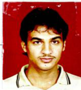
Page 2 of al Ghamdi's denied visa application. To our knowledge he was the only potential Saudi hijacker denied a U.S. visa.