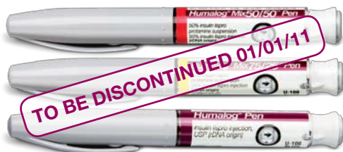
Original Prefilled Pen to be discontinued for Humalog brand of insulin

We do not currently anticipate any general supply limitations for Humulin® N (NPH human insulin [rDNA origin] isophane suspension) or Humulin® 70/30 (70% human insulin isophane suspension, 30% human insulin injection [rDNA origin]) in the original Prefilled Pen. We plan to continue manufacturing these options into 2011.