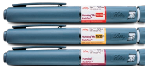
KwikPen™ remains available