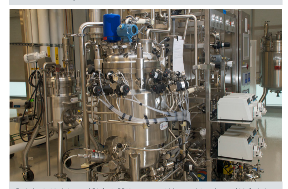
Berkeley Lab's Advanced Biofuels PDU can convert biomass into advanced biofuels in sufficient quantities for engine testing.