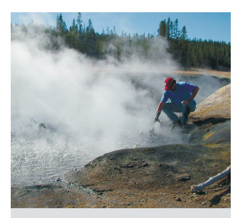
Scientist bioprospecting for microbes at Yellowstone National Park.