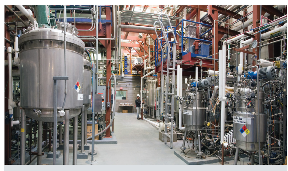
Researchers at NREL's Alternative Fuels User Facility study biochemical processes for the conversion of lignocellulosic biomass.