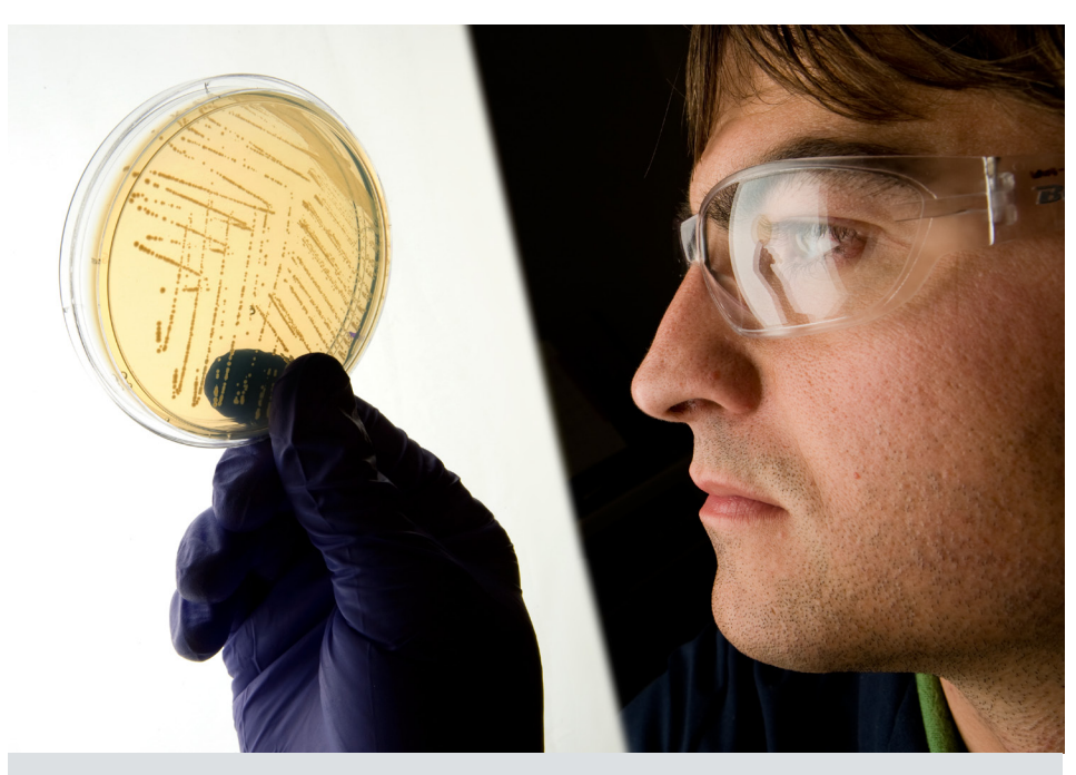
Researcher examines a transgenic yeast strain capable of cofermenting ethanol from glucose and xylose.