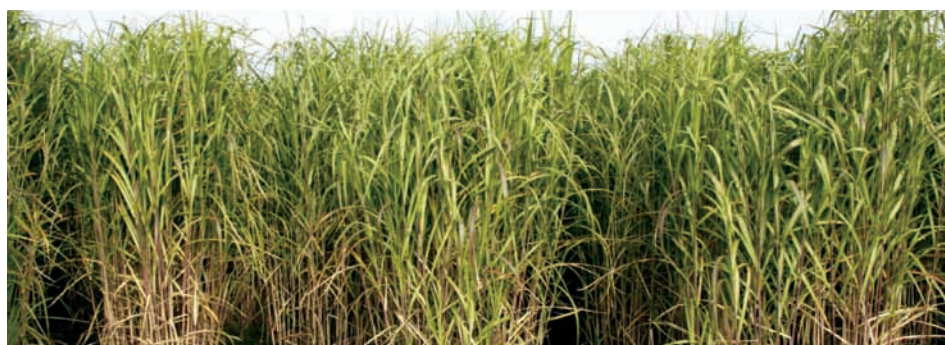
Program research in thermochemical conversion is helping to define feedstock criteria for reliable processing in pressurized systems.