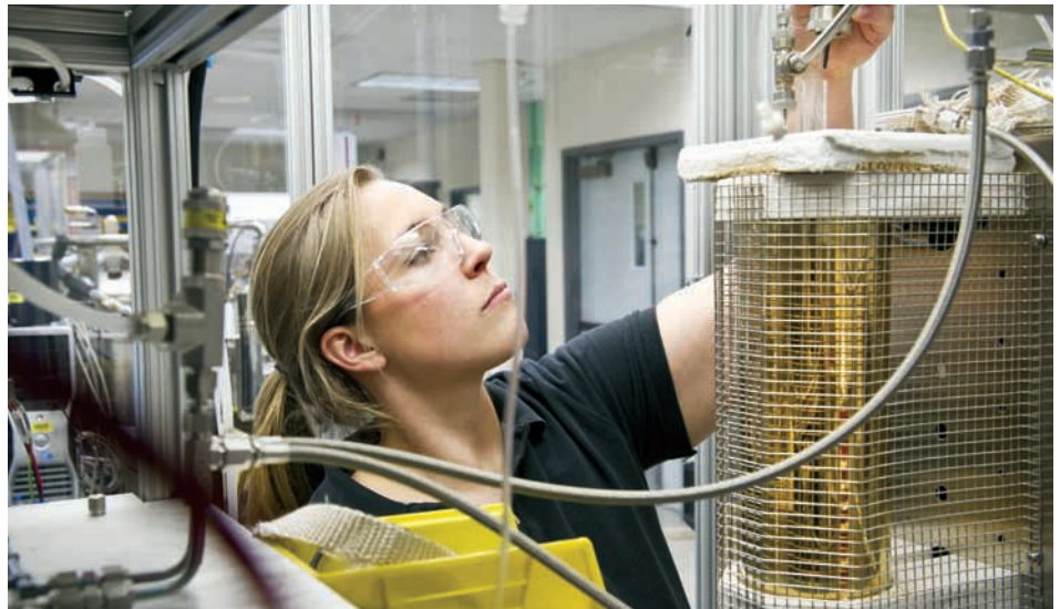
The National Renewable Energy Laboratory developed a fluidizable tar-reforming catalyst that converts tars (a by-product of gasification) into additional syngas for fuel synthesis.