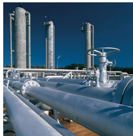
The Program is working to better understand the physical properties, reactivities, and compatibilities of biofuel intermediates for finishing in traditional petroleum refineries.

The Biomass Program is working in partnership with private industry and others to develop and scale up technologies for efficiently producing biofuels and bioproducts. Current projects are focused on enabling biorefineries to efficiently convert woody or ligno-cellulosic biomass into biofuels at demonstration and commercial scales.