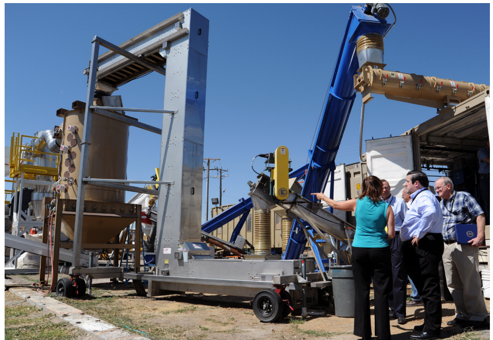
Biomass Program staff members tour the deployable Feedstock PDU located at Idaho National Laboratory.