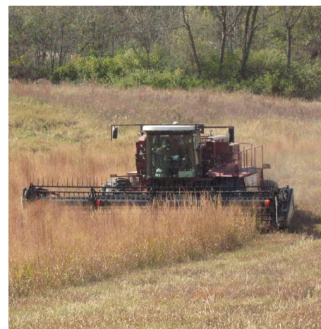
Switchgrass being harvested in Oskaloosa, IA, where researchers are working with Idaho National Laboratory to assess long-term biomass storage options.

Equipment developed by the project teams will undergo rigorous, industrial-scale field testing to establish cost and productivity benefits. Efficiency enhancements will reduce delivered costs, improve the net energy ratio, and reduce harmful emissions.