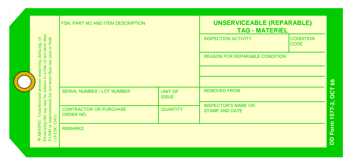
Figure 608-2. DD Form 1577-2, Unserviceable (Reparable) Tag-Materiel