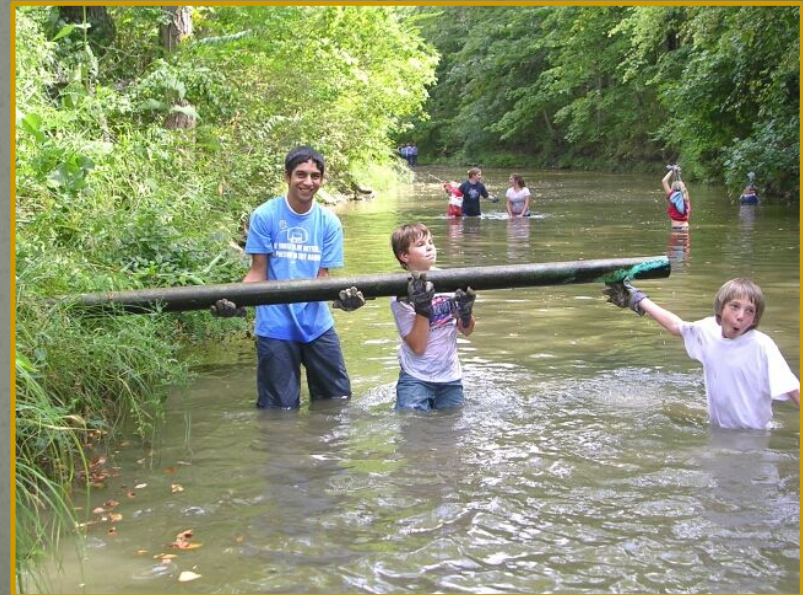
Fulton Middle School ST #3098