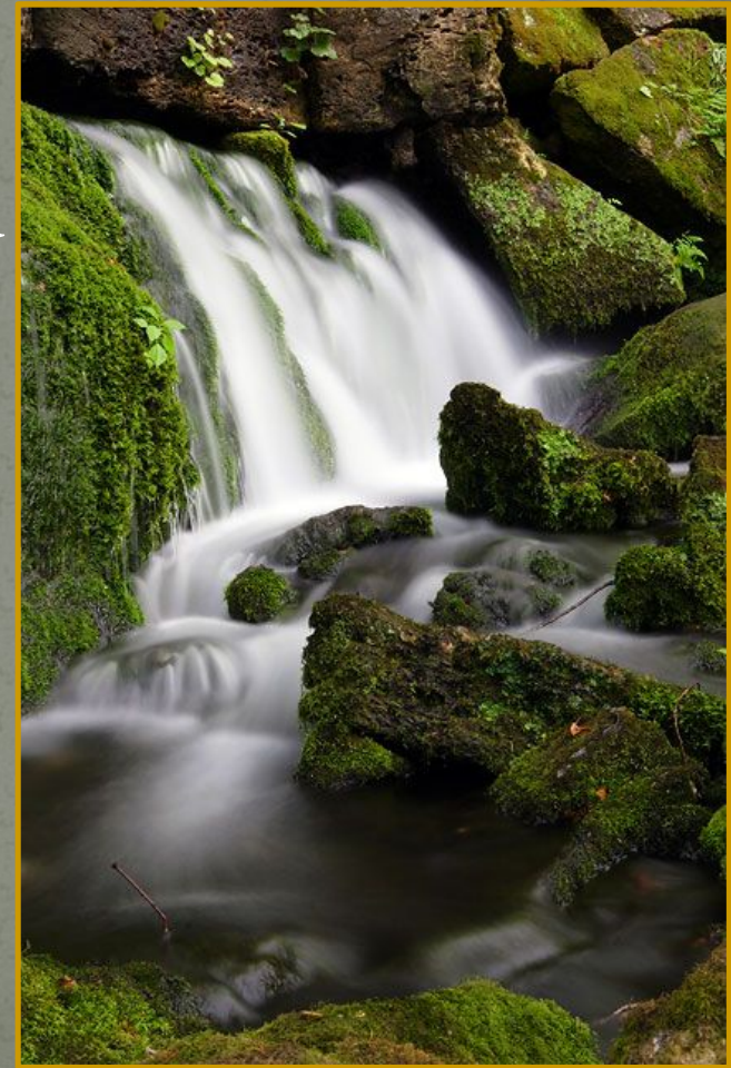
Spring on Eleven Point River