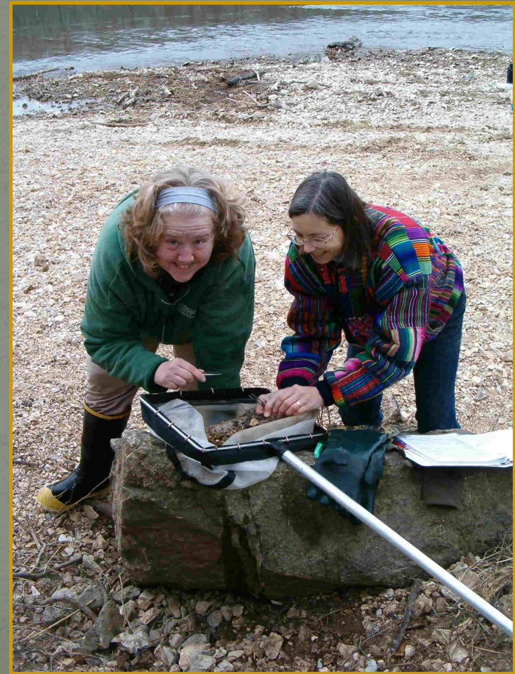
Fenton Stream Cleaners ST #1857