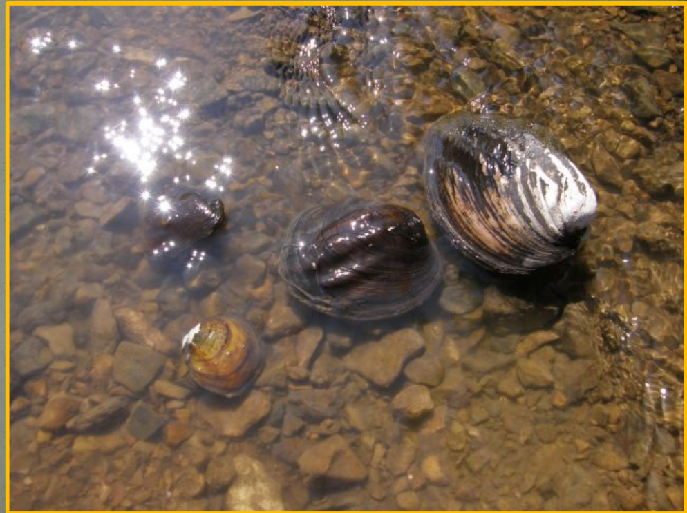
Mussels from the Lamine River