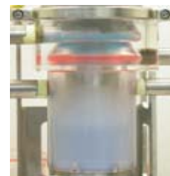
Effective mixing and separation in a laboratory device.

Research funded by the ORNL Laboratory Directed Research and Development Program, identified the limiting factor in batch biodiesel production, thereby more efficiently converting oil to biodiesel and separating the product biodiesel from byproduct glycerol. Biodiesel synthesis was demonstrated in a continuous-flow couette reactor/separator. This method is faster, more compact, and allows reaction and separation in one process step in the reactor.