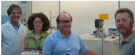
The ORNL biodiesel production team

Conventional reaction and separations used in biodiesel production are done in time-consuming batch processes, increases the size and cost of equipment and restricts the rate of production. ORNL researchers have developed a method for continuous production that yields an order-of-magnitude increase in production rates, while decreasing plant size and processing requirements.