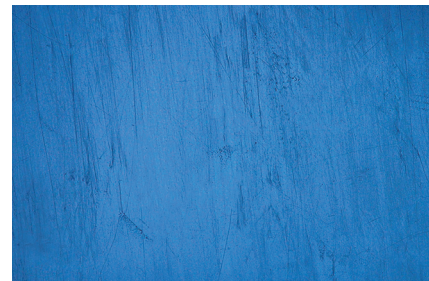
25" wide x 16.6" high

IMPORTANT - Use the EPS formatted Blue Bar Background logos, as these logos contain a built-in drop shadow.