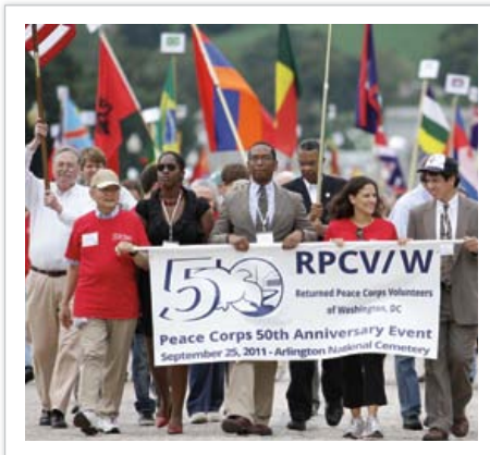
The Peace Corps Walk of Flags makes its way to the Lincoln Memorial.