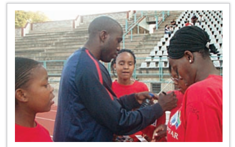
U.S. player Jozy Altidore signs autographs for children who were part of a trip to a World Cup practice that Volunteers helped organize in June.