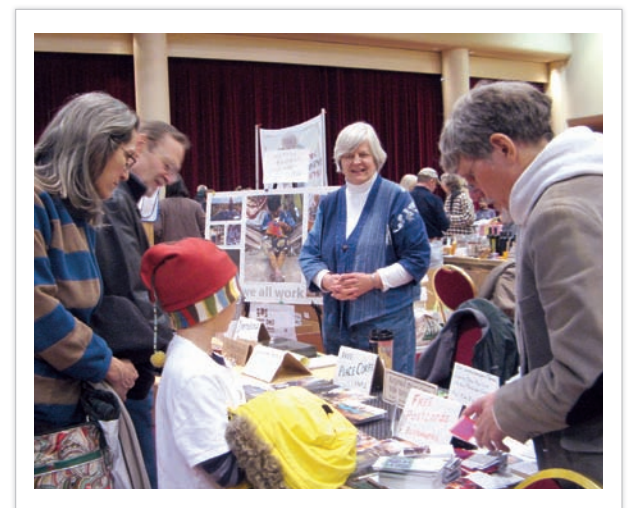
RPCVs of Wisconsin-Madison teach others about the Peace Corps during a recent event.

FSL has funded a women’s agricultural project and provided support for training nurses at a pediatric hospital in the past two years. Two primary schools, a technical school, and a community resources center in Sierra Leone also benefited from FSL’s help.