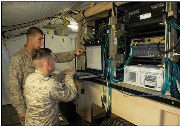
Marines monitor data in support of a combat operation center.