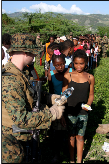
Marines providing humanitarian assistance and disaster relief.

Throughout this period of adjustment, we will “keep faith with our Marines, Sailors and their families.” Our approach to caring for them is based on our recognition and appreciation for their unwavering loyalty and unflinching service through a decade of combat operations. This strong commitment will not change.