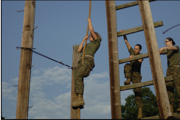
Marines training at Marine Corps Recruit Depot, Parris Island, SC.