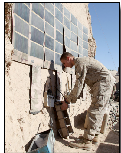
Marines utilizing a Solar Portable Alternative Communication Energy System.

Over the FYDP, I have directed $350 million to “Expeditionary Energy” initiatives. Fifty-eight percent of this investment is directed towards procuring renewable and energy efficient equipment. Some of this gear has already demonstrated effectiveness on the battlefield in Helmand Province. Twenty-one