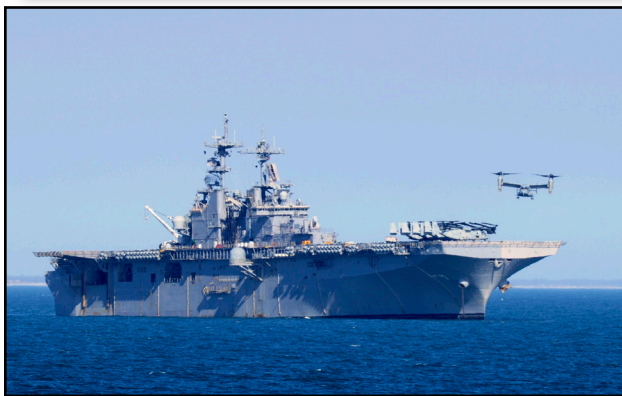
MV-22B Osprey prepares to land on the flight deck of the amphibious assault ship USS Wasp.

On a day-to-day basis, Marines will be forward-deployed and engaged, working closely with our joint and allied partners. When crises or contingencies arise, these same Marines will respond—locally, regionally or globally if necessary—to accomplish whatever mission the Nation requires.