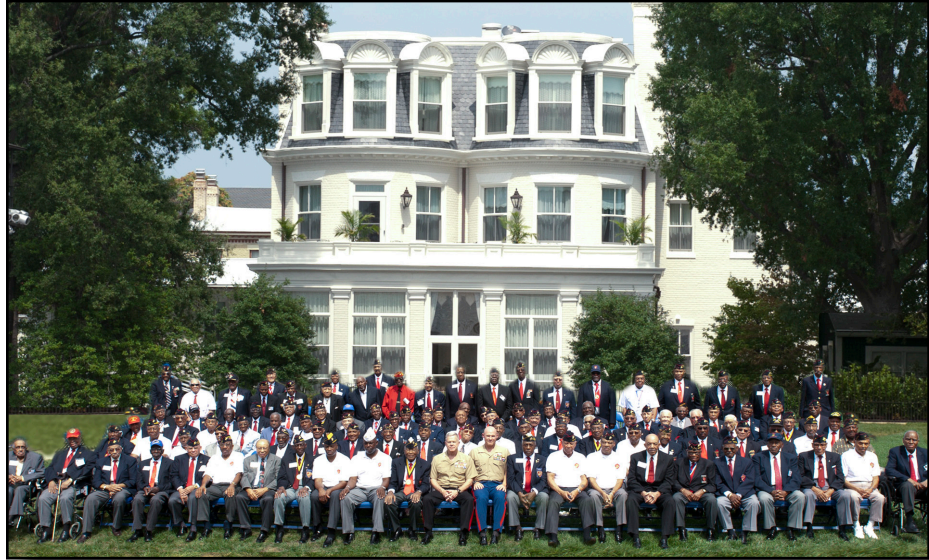
Commandant and Sergeant Major of the Marine Corps with Montford Point Marines.

highlight the importance of our SAPR program. Our victim-centric SAPR program focuses on: preventing sexual assault, improving a victim's access to services, increasing the frequency and quality of information provided to the victim regarding all aspects of his or her case and expediting the proper handling and resolution of a sexual assault case. We are credentialing our Sexual Assault Response Coordinators and Victim Advocates on victim advocacy. We have standardized training protocols for our 24/7 hotline, in use at all major bases and stations to provide information, resources and advocacy of sexual assault. We have increased SAPR training at all levels for our judge advocates (JA). This year, mobile training teams from our Trial Counsel Assistance Program will continue to instruct Navy Criminal Investigative Service agents and JAs on sexual assault investigation and best practices at bases and stations in Japan, Hawaii and on the East and West coasts.