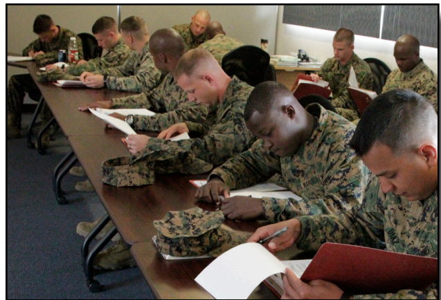
Marines study for a leadership exam at the Marine Corps Staff Academy, Camp Lejeune, NC.

Specifically, future training will center on the MAGTF Training Program. Through a standardized training approach, the MAGTF Training Program will develop the essential unit capabilities necessary to conduct integrated MAGTF operations. Building on lessons learned over the past 10 years, this approach includes focused battle staff training and a service assessment exercise modeled on the current exercise, Enhanced Mojave Viper. Additionally, we will continue conducting large scale exercises that integrate training and assessment of the MAGTF as a whole. The MAGTF Training Program facilitates the Marine Corps' ability to provide multi-capable MAGTFs prepared for operations in complex, joint and multi-national environments against hybrid threats.