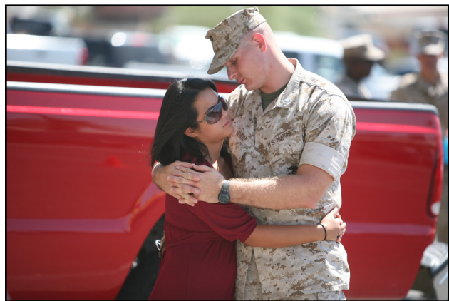
Currently 30,000 Marines are deployed around the world.

The challenging nature of the terrain in Afghanistan requires a greater level of dismounted operations than was the case in Iraq. This fact coupled with the prevalence of improvised explosive devices has caused a growing class of Marines and Soldiers to suffer catastrophic injuries—injuries involving multiple amputations that present significant quality of life challenges. Our Corps, the DoN, DoD, the Department of Veterans Affairs (VA) and Congress are concerned about this special group of Wounded Warriors must remain committed to supporting this special group of Wounded Warriors. To help the catastrophically injured (those who will likely transition to veteran status) and their families successfully meet these challenges, we must continue engaging in a high level of care coordination between our WWR advocates, the VA's Federal Recovery Coordinators, VA Liaisons for Healthcare stationed at DoD Military Treatment Facilities (MTFs), Operation Enduring Freedom/Operation Iraqi Freedom/Operation New Dawn Case Managers and medical providers to ensure all of our wounded Marines' needs are met. This includes arranging for assistive technologies, adaptive housing, and all available health care and benefits (DoD and VA) they have earned. Additionally, WWR's Marine Corp Liaison assigned at the VA collaborates closely with VA Care Management team to resolve Marine Corp issues or care management needs.