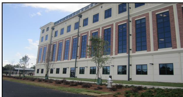
Joseph J. McCarthy Building, Marine Forces Reserve Headquarters.

FY13 Military Construction: The Marine Corps maintains a commitment to facilities and infrastructure supporting both operations and quality of life. Our military construction and family programs are important to sustain our force structure and maintaining readiness. This fiscal year we are proposing a $761 million Military Construction (MILCON) program to support warfighting, family housing and infrastructure improvements. The focus of our efforts this fiscal year is the construction of Joint Strike Fighter and MV-22B support facilities, infrastructure improvements, and training and education facility improvements. Additionally, this budget request includes replacement of inadequate and obsolete facilities at various locations.