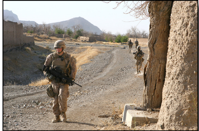
Marines patrol through Now Zad in Helmand Province, Afghanistan.

After 10 years of constant combat operations, the Marine Corps must reset the force coming out of Afghanistan.