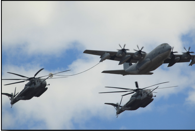
CH-53Es receive fuel from a KC-130J Tanker.

Bridging a seam in our Nation’s defense between heavy conventional and special operations forces (SOF), the United States Marine Corps is light enough to arrive rapidly at the scene of a crisis, but heavy enough to carry the day and sustain itself upon arrival. The Marine Corps is not designed to be a second land army. That said, throughout the history of our Nation, its Marines have been called to support sustained operations from time to time. We are proud of our ability to contribute to land campaigns when required by leveraging and rapidly aggregating our capabilities and capacities. Primarily though, the Corps is a critical portion of our integrated naval forces and designed to project power ashore from the sea. This capability does not currently reside in any other Service; a capability that has been called upon time and again to deter aggression and to respond quickly to threatening situations with appropriate military action.