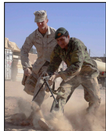
Training the Afghan National Army.

Engagement: In order to keep large crises from breaking out or spilling over to destabilize an entire region, 21st century security challenges also require expansion of global engagement with partner and allied nations—facilitated through persistent forward Naval