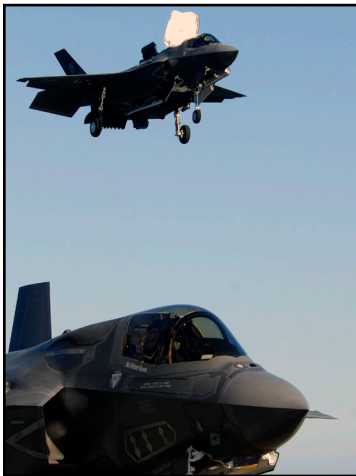
F-35B approaches the flight deck of USS Wasp.

As we reduce end strength, we must manage the rate carefully so we reduce the force responsibly. We will draw-down our end strength by approximately 5,000 Marines per year. The continued resourcing of this gradual ramp-down is vital to keeping faith with those who have already served in combat and for those with families who have experienced resulting extended separations. The pace of active component draw-down will account for completion of our mission in Afghanistan, ensuring proper resiliency in the force relative to dwell times. As our Nation continues to draw-down its Armed Forces, we must guard against the tendency to focus on pre-9/11 end strength levels that neither account for the lessons learned of 10 years at war nor address the irregular warfare needs of the modern battlefield. Our 182,100 Marine Corps represents fewer infantry battalions, artillery battalions, fixed-wing aviation squadrons, and general support combat