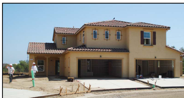
A duplex awaits final touches at one of Camp Pendleton's newest neighborhoods.

located at Camp Lejeune, North Carolina; Camp Pendleton and Twentynine Palms, California; and Marine Corps Base, Hawaii. These BEQ projects were typically completed in two years, with most at or below cost. These facilities, that incorporated energy efficiency measures, have significantly improved the quality of life of our single Marines, who for many years, lived in substandard, World War II era barracks. Our FY13 MILCON program includes a $49 million request for barracks, a motor pool and other facilities to support the consolidation of Marine Corps Security Force Regiment assets at Naval Weapons Station, Yorktown, Virginia. This project was not a part of our original BEQ initiative, but is necessary as the current facilities used by the Regiment at Naval Station Norfolk have been condemned.