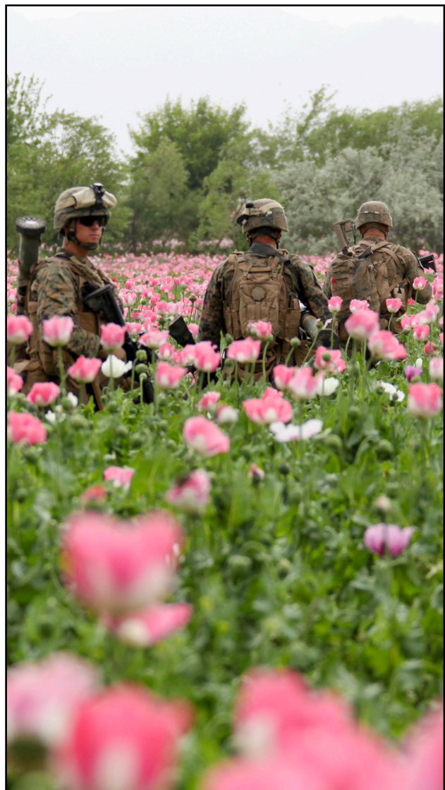
Marines returning to base after a security patrol in Helmand Province, Afghanistan.

Through judicious choices, forward planning and wise investments—ever mindful of the economy in which we live—we have worked diligently to determine the right size our Corps needs to be and to identify the resources we will require to respond to crises around the world, regardless of climate or place. As we continue to work with Congress, the Navy and the DoD in maintaining the institutional pillars of our high state of readiness, you have my assurance that your Corps will be "ever faithful" in meeting our Nation's need for military crisis response.