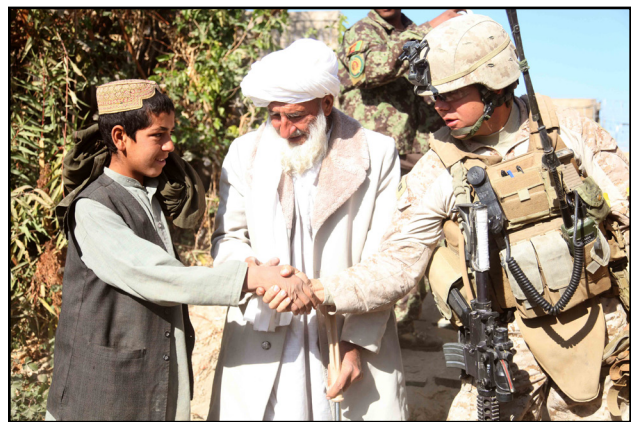
Sangin District, Afghanistan