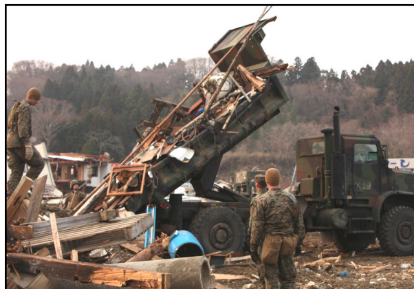
31st MEU at Uranohama Port, Oshima Island, Japan, in support of Operation TOMODACHI.

Day-to-Day Crisis Response: Engagement and crisis response are the most frequent reasons to employ our amphibious forces. The same capabilities and flexibility that allow an amphibious task force to deliver and support a landing force on a hostile shore enable it to support forward engagement and crisis response. The Geographic Combatant Commanders have increased their demand for forward-postured amphibious forces capable of conducting security cooperation, regional deterrence and crisis response.