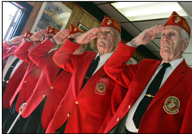
Keeping faith with our Veteran Marines.

importance of varying perspectives, compassion, courage, perseverance and self sacrifice through the Montford Point Marine history. We are thankful to Congress for recently conferring the Congressional Gold Medal on the Montford Point Marines, a fitting tribute to a pioneering group of Marines who fought valiantly in some of the bloodiest battles of the Pacific and later went on to serve in Korea and Vietnam.