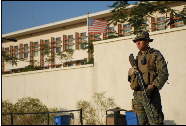
Marines provide security for 154 U.S. Embassies and consulates in 137 countries around the world.

American lives and property in Bahrain, Egypt and Yemen as crisis events unfolded across the Middle East.