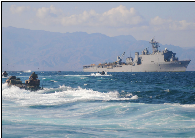
USS Carter Hall in the Gulf of Aden.

Joint Force. More than 60 years ago and arising out of the lessons learned from the Korean War, the 82nd Congress envisioned the need for a force that “is highly mobile, always at a high state of combat readiness...in a position to hold a full-scale aggression at bay while the American Nation mobilizes its vast defense machinery.” 6 This statement continues to describe your Navy and Marine Corps Team today. It is these qualities that allow your Marine Corps to protect our Nation’s interests, reassure our allies and demonstrate America’s resolve.