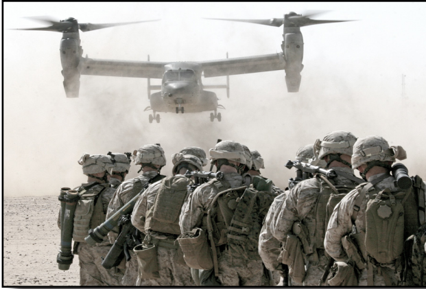
Marines wait to board an MV-22B Osprey near Camp Buehring, Kuwait.