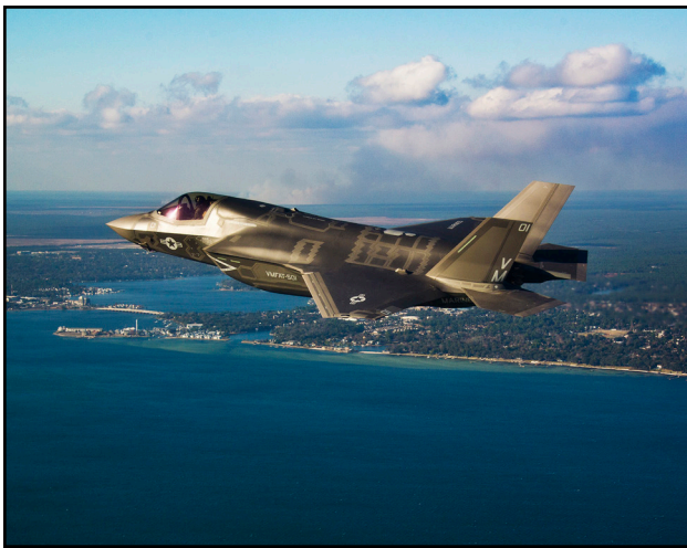
F-35B Lightning II Joint Strike Fighter en-route to Eglin Air Force Base.

The F-35B program has been a success story over the past year. Due to the performance of F-35B prototypes in 2011, the program was recently removed 12 months early from a fixed period of scrutiny. The F-35B completed all planned test points, made a total of 260 vertical landings (versus 10 total in 2010) and successfully completed initial ship trials on USS Wasp. Delivery is still on track; the first three F-35Bs arrived at Eglin Air Force Base in January of this year. Continued funding and support from Congress for this program is of utmost importance for the Marine Corps as we continue with a plan to “sundown” three different legacy platforms.