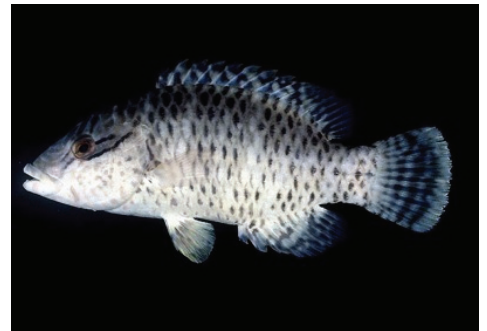
Humphead wrasse, Cheilinus undulatus .

All fact sheets are available for download on the program's website (see pg. 4).