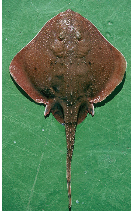
Thorny skate, Amblyraja radiata .

Staff provided training to Regional Fishery Management Council members on the Species of Concern program and SOC species that overlap with those considered by the Councils' to be overfished or undergoing overfishing.