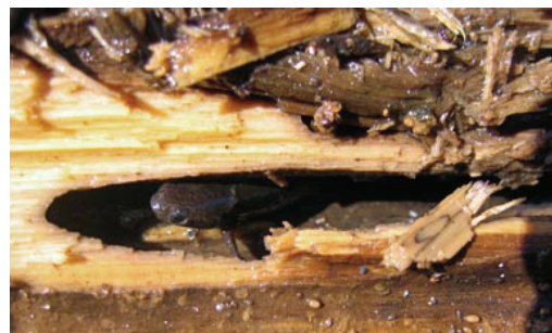
Mangrove rivulus, Rivulus marmoratus , in damp terrestrial habitat where they can breathe air.