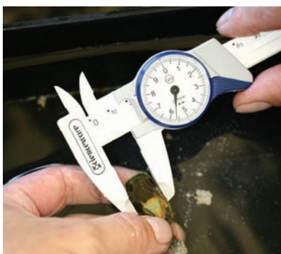
Norton Chan, Aquarist at Waikiki Aquarium, measuring the width of a Lingula .