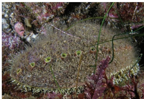
Green abalone, Haliotis fulgens.

Partners have been essential to the accomplishments of the SOC program!