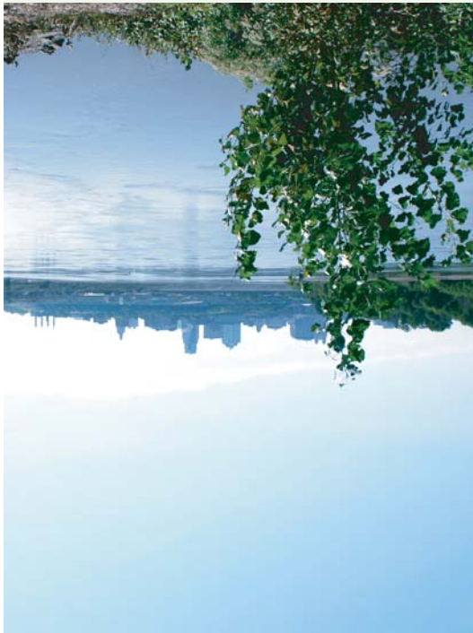
On the cover: A view of downtown Kansas City, Mo., from Kaw Point — the confluence of the Kansas and Missouri rivers — in Kansas City, Kan.