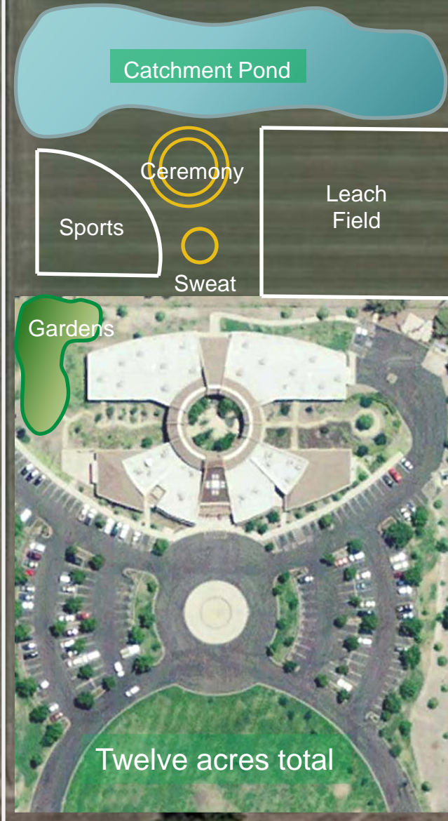
FEATHER RIVER TRIBAL HEALTH CENTER (Butte County) one example of cultural design vernacular