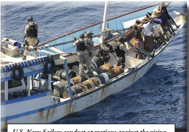
U.S. Navy Sailors conduct operations against the rising threat of international piracy which, by some estimates, costs the maritime shipping industry approximately $9B a year.

Introduction & Overview. U.S. Naval Forces Europe/Africa/Commander SIXTH Fleet (C6F), conducts the full range of maritime operations and Theater Security Cooperation in concert with NATO, coalition, joint, interagency, and other partners in Europe and Africa. Naval Forces Europe/Africa/C6F continues to perform Navy Component Commander functions supporting daily Fleet operations and Joint Maritime Commander/Joint Task Force Commander missions, thereby strengthening relationships with enduring allies and developing maritime capabilities with emerging partners, particularly in the theater's southern and eastern regions.