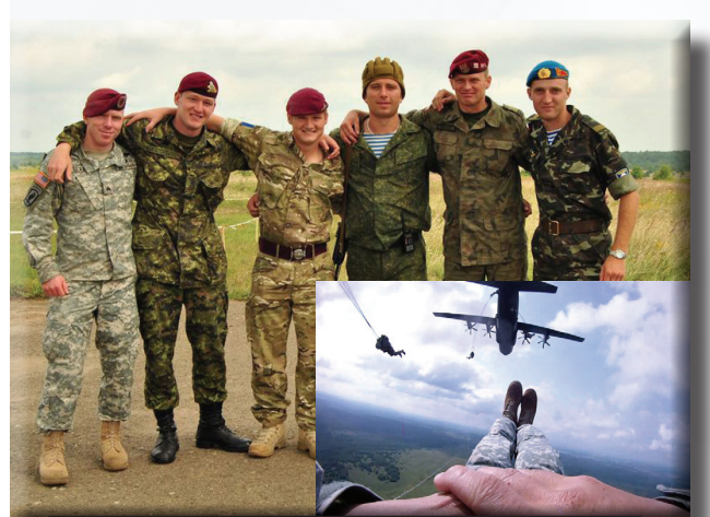
Paratroopers from (left to right) the U.S., Canada, the U.K., Belarus, Poland and Ukraine join together for a photograph to commemorate RAPID TRIDENT 2011, a first-of-its-kind multinational airborne exercise designed to promote regional stability and security, strengthen international military partnering, foster trust, and improve interoperability among participating nations. RAPID TRIDENT 2011 was led by U.S. Army Europe , and conducted at the International Peacekeeping and Security Center in Yavoriv, Ukraine.

Black Sea Exercises. Focusing on partnerships and interoperability in the Black Sea region, RAPID TRIDENT assembled 1,600 forces from 13 countries to conduct the first-ever multinational airborne drop into Ukraine, developing important land warfare skills and camaraderie among key NATO and non-NATO partners in a critical area of the world. JACKAL STONE 11, Special Operations Command Europe's annual capstone exercise, involved eight nations and over 1,500 partner nation Special Operations Forces (SOF) sharpening theater SOF capabilities in all mission sets from counterterrorism to highintensity conflict. Exercise SEA BREEZE joined naval and marine forces from 14 countries in the Black Sea to exercise maritime interdiction, counter-piracy, non-combatant evacuation operations, and actions to counter