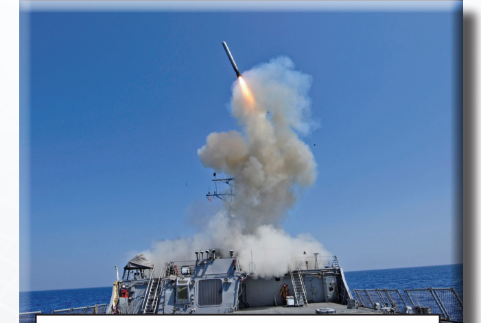
MEDITERRANEAN SEA (March 29, 2011) The Arleigh Burke-class guided missile destroyer USS Barry (DDG 52) launches a Tomahawk cruise missile in support of Operation ODYSSEY DAWN in Libya.

Libya Operations. Naval Forces Europe/Africa/C6F's posture and readiness were ideally suited to support Libya operations, wherein its forward naval bases—including Naval Air Station Sigonella,Italy and Naval Support Activity Souda Bay, Greece—played a vital role in