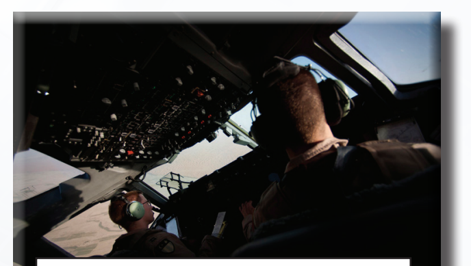
U.S. Air Forces in Europe flew over 26,000 combat hours to support operations in Iraq and Afghanistan with fighter and logistical aircraft, to include the resupply mission of this C-17 Globemaster III delivering supplies from Incirlik Air Base, Turkey, to Kandahar Air Field, Afghanistan, in August 2011.

Major Accomplishments. Air Forces in Europe flew over 26,000 combat hours to support ongoing contingency operations in 2011, working daily with our NATO allies and partners to provide security across the European Theater and the globe. Of special note, forward-based air forces were essential to the United States'ability to rapidly respond to emerging operational requirements in Libya. Air Forces in Europe played a major role, providing seasoned leadership, expert command and control across the full spectrum of air operations, and the initial