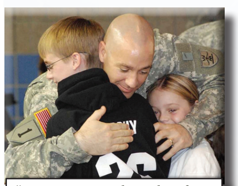
"We must preserve the quality of our All-Volunteer Force and not break faith with our men and women in uniform or their families."