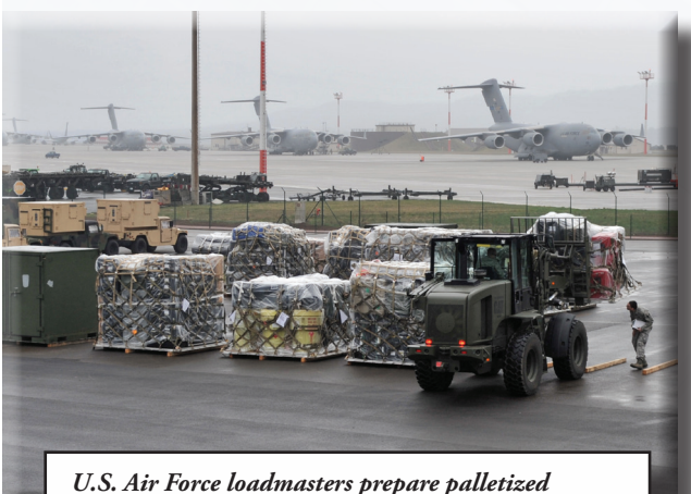
U.S. Air Force loadmasters prepare palletized humanitarian aid supplies for delivery to Turkey in the wake of last October's 7.2-magnitude earthquake in the northeastern part of the country. Theater air forces were essential in providing rapid disaster response to this important NATO Ally in its hour of need.

An instrumental global communications hub, Air Forces in Europe provides vital data links