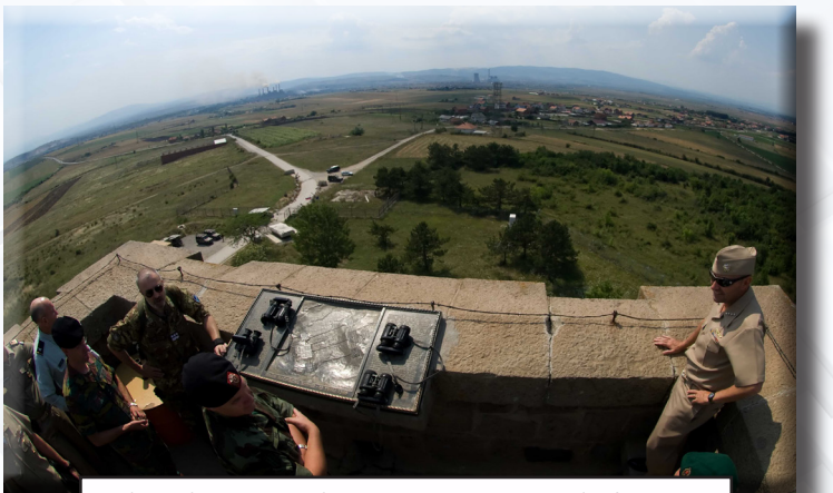
Admiral Jim Stavridis in Kosovo surveying the famous Field of Blackbirds, an ancient Balkan battle ground.

Ashore, he served as a strategic and long-range planner on the staffs of