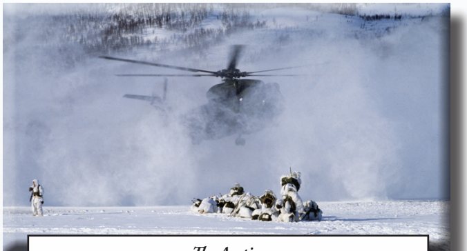
The Arctic: An emerging zone of cooperation

expand understanding and awareness of the legal, security, commercial, and political ramifications of the changing Arctic environment, while strengthening relationships with other Arctic nations. The ARCTIC ZEPHYR exercise series will culminate in 2013, and remains one of the areas where we seek to find common ground and zones of cooperation with Russia.