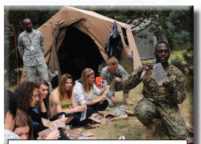
Theater forces conduct important relationship-building events through EUCOM's Partnership-for-Peace program, preserving and strengthening our strategic partnerships.

Relationships. Our experience in operating as part of multinational coalitions has demonstrated the importance of developing and sustaining long-term relationships with our allies