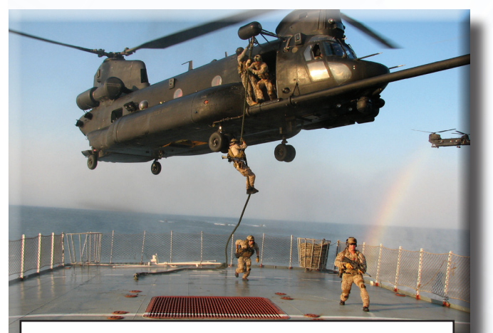
U.S. Special Forces from Special Operations Command Europe, alongside Romanian and Croation SOF, conduct fast-rope insertion training from a Chinook helicopter onboard a ship at sea during Exercise JACKAL STONE 11.

Third, Special Operations Command Europe continued to prepare for contingency missions through an intense exercise schedule, while responding to actual contingency tasking. During our