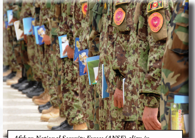
Afghan National Security Forces (ANSF) align in formation at the Capital Division Headquarters. ANSF continues to make sutained progress in training, professionalism, and literacy, driving positive change and feedback across the Afghan population.

partners have played an essential role in supporting this transition and maintaining the enduring partnership that follows. Europeans currently contribute approximately 25% of the mentoring teams required to train Afghan National Security Forces in the field, as well as gendarmerie and other instructor personnel serving at regional police training centers. Our European allies and partners understand the vital importance of this mission. They remain willing to send their sons and daughters into harm's way alongside the United States to bring peace, security, and prosperity to the people of Afghanistan. Their commitment also comes at a precious