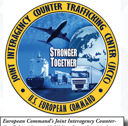
European Commana's form interagency Counter-Trafficking Center (JICTC) is focused on combating transnational illict trafficking networks and their support to organized crime and terrorism.

Embracing a whole-of-government design, JICTC is maturing steadily as a robust interagency team that includes representatives from the Departments of State, Treasury, and Energy; Customs and Border Protection; the Federal Bureau of Investigation; Immigrations and Customs Enforcement; and the Drug Enforcement Administration. JICTC's work—in conjunction with our interagency partners and the other combatant commands, including U.S. Africa Command, U.S. Central Command, and U.S. Special Operations Command—helps to close the seams that traffickers exploit, and to synchronize