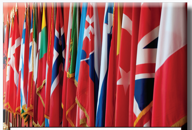
European Command's access, presence, and engagement continues to preserve our vital strategic partnerships.

National Guard State Partnership Program: We are very proud of this low-cost, high payoff program. One of European Command's most unique, cost effective, and essential international engagement tools, the State Partnership Program partners U.S. National Guardsmen from