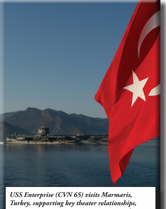
Turkey, supporting key theater relationships, ongoing maritime security operations, and important EUCOM Theater Security Cooperation objectives.

Theater Security Cooperation. Naval Forces led Europe/Africa/C6F Eurasia Partnership Capstone, a flagship initiative designed to integrate various maritime efforts across the region into a comprehensive partnership. Training with naval forces from Azerbaijan, Bulgaria, Georgia, Greece, Lithuania, Malta, Poland, Romania, Turkey, and Ukraine, Naval Forces Europe/Africa/C6F enhanced capabilities in Maritime Interdiction Operations; Visit, Board, Search, and Seizure; search and rescue; maritime law enforcement; and environmental protection. In the Partnership of Adriatic Mariners program, U.S. naval forces joined with countries along the Adriatic Sea to increase proficiency in Maritime Domain Awareness and counter-illicit trafficking operations. As part of this effort, sailors from Croatia, Montenegro, and Albania embarked in USS MITSCHER and USS MONTEREY, spending two weeks gaining experience in these important skills.