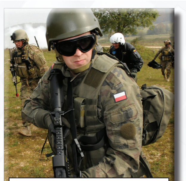
A Polish Special Operations Forces Command soldier, front, trains alongside U.S. Special Operations Forces at the Joint Multinational Readiness Center in Hobenfels, Germany.

personnel from 15 countries for deployment. Additionally, European Command conducted 21 Expeditionary Intelligence Training Program courses, providing fundamental counterinsurgency intelligence and operational skill sets for 628 personnel from 25 countries, and trained 2,135 soldiers from 18 countries in life-saving counter-IED skills. Finally, in 2011, European Command trained two Polish Brigades, two Romanian battalions, and two Georgian battalions for deployment to Afghanistan. All of these activities provide crucial linkages, personally and professionally, between the U.S. military and these deploying coalition forces. Without these relationships, contributions, and training conducted to a common standard, the challenges we face deployed side-by-side with these partners