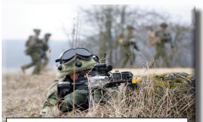
A Georgian soldier receives training through the Marine Forces Europe Georgia Deployment Program. The phase of training shown above was conducted at the Joint Multinational Training Center, Germany.

Georgia Deployment Program—International Security Assistance Force. In support of nationally directed theater strategic end states, Marine Forces Europe leads European Command's joint mission to train the Georgian Armed Forces. Executing this mission since 2010, Marine Forces Europe has developed and implemented a program that has trained and deployed a total