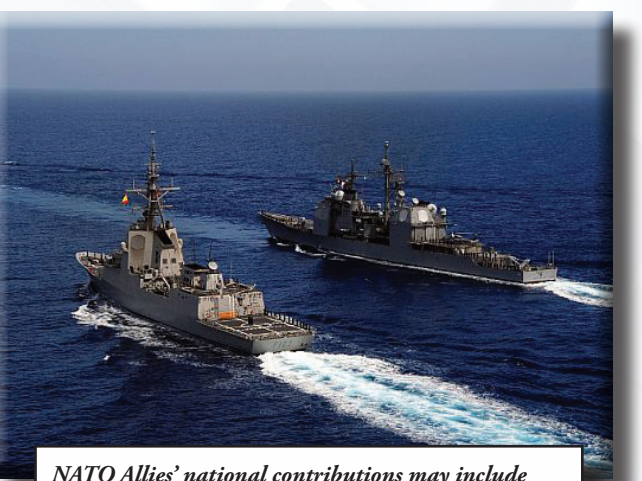
NATO Allies' national contributions may include surface combatants 'riding shotgun' to provide at-sea protection of U.S. Aegis BMD platforms.

missile defense capability for the protection NATO's European populations, of territory, and forces. Supporting that effort, European Command has already fielded workstations employing the NATO-compatible U.S. BICES network throughout our headquarters and our Service Components' headquarters in order to provide a communication system able to support NATO's ballistic missile defense mission. This spring, European Command will add U.S. ships to the U.S. BICES architecture, further integrating our theater sensors, shooters, and platforms. There has also been a remarkable increase in the