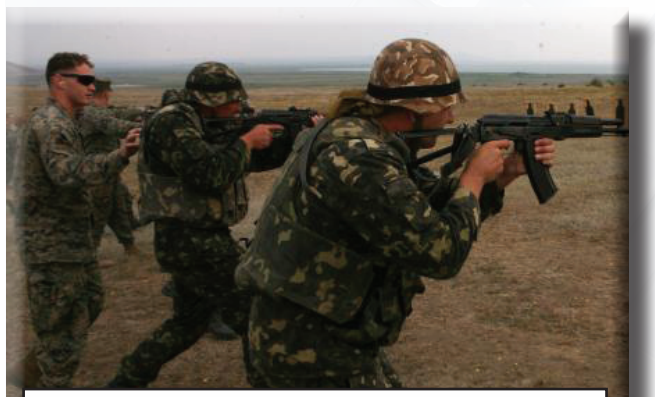
Marine Forces Europe instructors train Ukrainian soldiers on the firing range during their last cycle of counterinsurgency training before deployment to ISAF.

U.S. Marine Corps' Black Sea Rotational Force. The U.S. Marine Corps' Black Sea Rotational Force is a multi-year program rotating Marine air and ground units, based in the U.S., on deployment to bases in the Black Sea region in order to strengthen military capabilities, provide regional stability, and develop lasting partnerships with nations in this important region. In