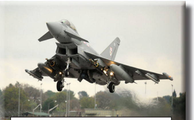
A British Typhoon fighter jet takes off for a combat mission over Libya during NATO's Operation UNIFIED PROTECTOR. NATO air assets conducted over 26,500 sorties to protect the Libyan people.

over 9,700 strike sorties to protect the people of Libya from attack or the threat of attack. A total of 49 ships from 12 nations, along with surveillance assets provided by submarines and maritime aircraft, supported the operation in the Mediterranean Sea. Ships conducted more than 3,000 intercepts for hailings, 311 boardings, and 11 denials. The NATO Alliance worked as it was designed to do, with our allies and partners sharing the burdens and responsibilities of these operational missions.