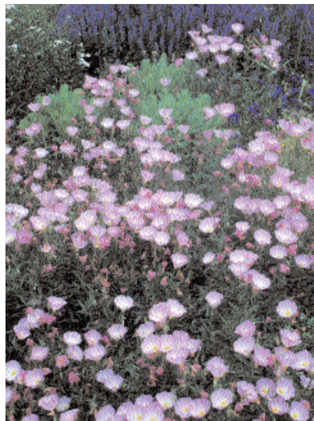
Meadow Sage (Salvia pratensis) is the background for New Mexico Evening Primrose (Oenothera berlandieri 'siskiyou')