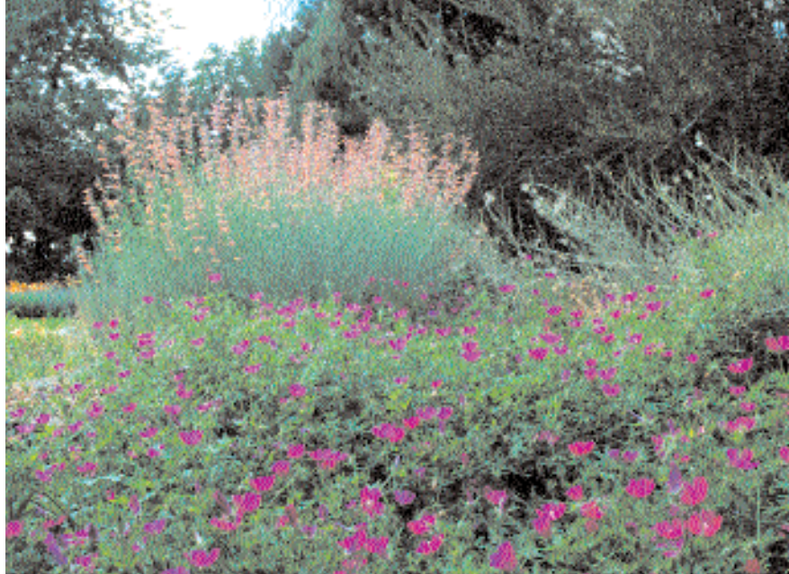
Wine Cup (Callirhoe involucrata) and Sunset Hyssop (Agastache rupestris) in the Denver Water Xeriscape Garden

Mulches aid in greater retention of water by minimizing evaporation, reducing weed growth, moderating soil temperatures, and preventing erosion. Organic mulches also improve the condition of your soil as they decompose. Mulches are typically composed of wood bark chips, wood grindings, pine straws, nut shells, small