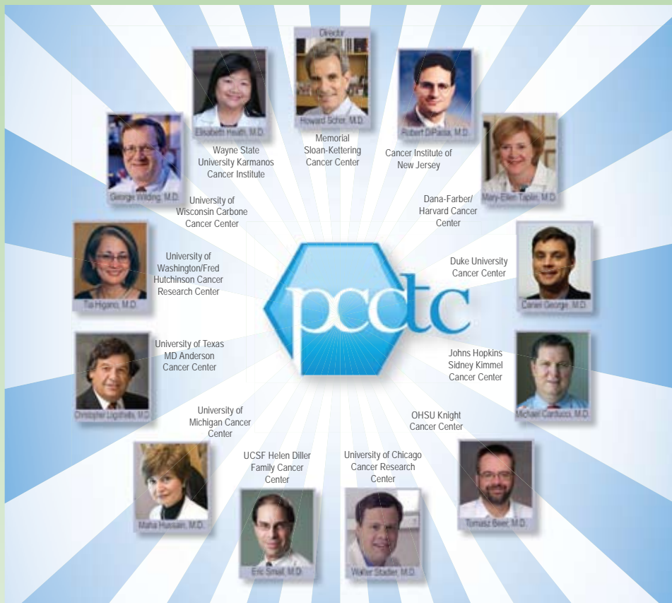
Figure 1. The PCCTC is represented by 13 leading cancer centers across the country.

Among the most promising agents the Consortium is focused on, abiraterone acetate exemplifies the rapid progress of agents to Phase III clinical trials under the direction of the PCCTC. Abiraterone blocks the synthesis of androgens in the testes, in the adrenal gland, and in prostate tumors through the inhibition of the enzyme CYP17 ( Figure 2 ). The drug was introduced into the PCCTC in 2006 by Charles Ryan, M.D., of the University of California San Francisco, as a Phase I clinical trial in patients who had already received chemotherapy. Decreased androgen levels and other promising outcomes led to the initiation of three Phase II clinical trials in 2006 and 2007. These trials further demonstrated decreased prostate-specific antigen (PSA) levels in nearly 40% to 50% of patients, warranting further investigation. An international Phase III trial, also in patients who had already received chemotherapy, led by Dr. Scher and Dr. Johann de Bono of the Royal Marsden Hospital in London, was initiated by the PCCTC in June 2008