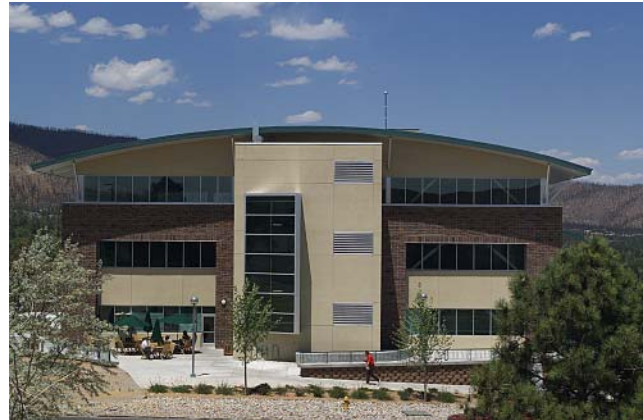
Los Alamos Research Park

The Laboratory actively assisted Los Alamos Commerce and Development Corporation in the planning and launch of the Los Alamos Research Park project in 2001. The facility houses important strategic partners to the Laboratory, such as Motorola and the University of California. It is also home to LANL's Superconductivity Technology Center co-located with several industry partners and a Synergy Center, in which several LANL small spin-off companies such as Isotag and Radion Technologies reside. The Laboratory was recognized as the "2001 Laboratory of the Year" by the Federal Laboratory Consortium midwestern region for its Research Park project support.