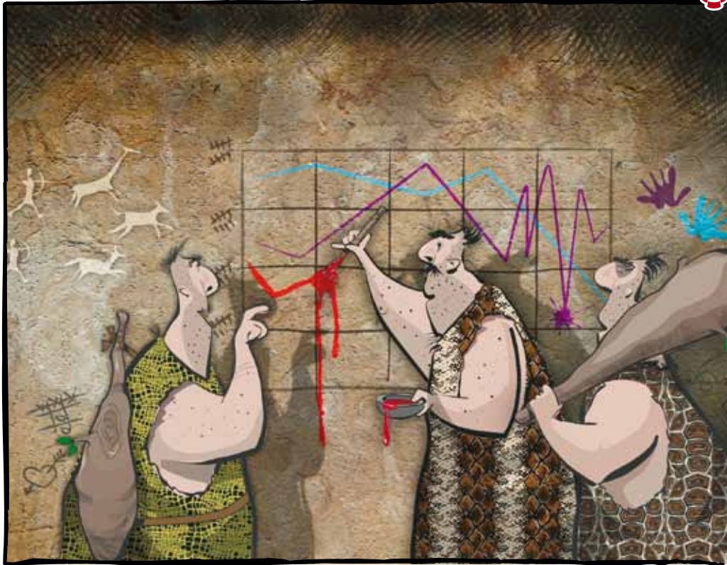
10,000 BC: C.A.I.V. men invent Cost As an Independent Variable

PM may need to recognize a losing battle and work to gracefully end a program.