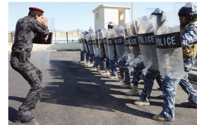
Iraqi Police officer in Ramadi instructs fellow officers on proper riot control procedures in March 2011.

As the Department of State (DoS) moves forward with its transition plans and U.S. troops prepare to depart Iraq by December 31, 2011, Prime Minister Nuri al-Maliki and his coalition partners continued this quarter with the process of forming a new government. These various transitions create fiscal, political, and security vulnerabilities that, if not carefully tended, could have significant adverse effects. For example, in taking over the police-training mission from the Department of Defense (DoD), DoS will assume enormous management and policy responsibilities—and do so with less than 200 personnel assigned to the mission. It will implement its Police Development Program (PDP) in a still-fragile security environment, working closely with an as-yet-unappointed Minister of Interior, who will oversee Iraq's police. As of mid-April, neither the Ministry of Interior nor the Ministry of Defense had a permanent leader.