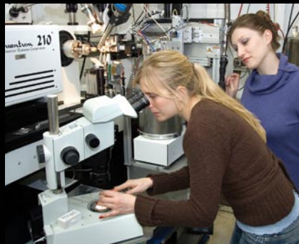
Students prepare a biological crystal sample for analysis at an NSLS beamline.