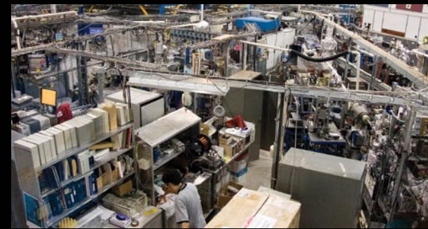
Scientists work on the open, busy environment of the vacuum ultraviolet-infrared experimental floor.

In conjunction with Brookhaven's Center for Functional Nanomaterials (CFN), the NSLS provides researchers with state-of-the-art capabilities to probe the unique properties of matter at an extremely small scale — the nanoscale. Nanoparticles, particles with dimensions on the order of billionths of a meter, offer different chemical and physical properties than bulk materials and, therefore, could have revolutionary impacts, from more efficient energy generation and data storage to improved methods for diagnosing and treating disease.