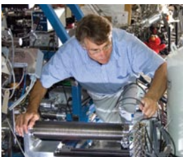
This researcher from the Honeywell company UOP LLC uses light source techniques to study catalysis.

For research that ranges from designing catalysts to developing computer chips, scientists from dozens of industries are drawn to the NSLS because the facility provides advanced analytical capabilities that are not available at their home laboratories.