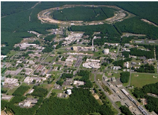
Brookhaven's 5,300-acre site features research facilities for diverse scientific fields.

Brookhaven's 2,600 scientists, engineers, and support staff are joined each year by more than 5,000 visiting researchers from around the world.