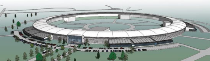
Conceptual rendering of NSLS-II

The new facility will be a state-of-the-art, world-leading synchrotron that will produce x-rays up to 10,000 times brighter than those generated by the current NSLS. Its superior capabilities will reinforce U.S. scientific leadership, enabling scientists to explore the challenges they face in developing new materials with advanced properties. Scheduled for completion in 2015, NSLS-II will lead to significant advances in condensed matter and materials physics, chemistry, and biology – advances that will ultimately enhance national security and help drive the development of abundant, safe, and clean energy technologies.