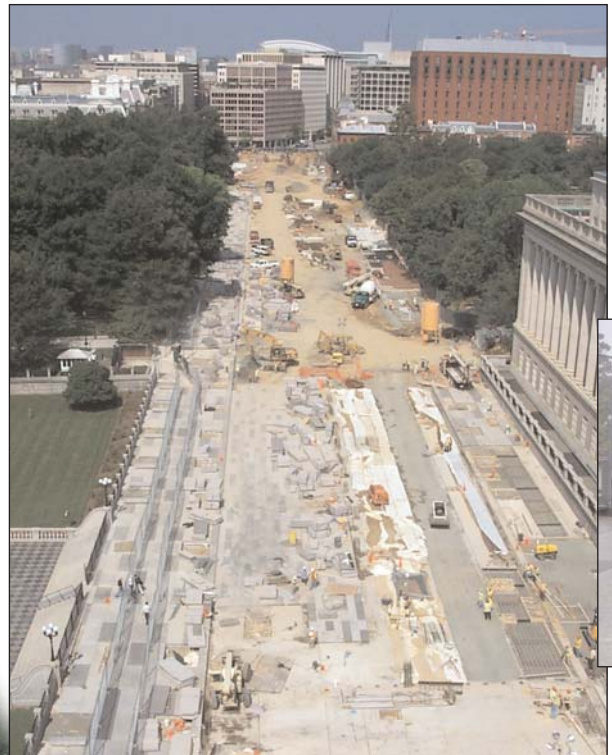
Aerial view of construction in July 2004

The FHWA began construction on the site in January 2004. Working on an expedited schedule, the agency completed a design that is both elegant and secure—a public streetscape for all Americans and our nation’s visitors to enjoy.