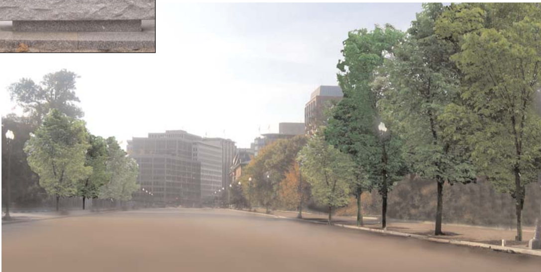
A planting scheme of Princeton American elms will be in place along the Avenue by spring 2005. They will provide shade for pedestrians, a magnificent promenade for America’s Main Street, and a dignified setting for the White House.

In spring 2005 when planting conditions are favorable, 88 mature Princeton American elms will be planted along the Avenue. The trees will stand where concrete bollards once lined the front of the White House. The American elm has a high arching form that will provide a spectacular promenade as well as wonderful fall color and an attractive winter form. The new trees will provide a welcome canopy for pedestrians and a gracious setting for the White House grounds. The planting scheme will consist of a single row of street trees along the north and south curbs of Pennsylvania Avenue and a double row of trees along the south curb of the Avenue in front of the Eisenhower Executive Office Building and the Treasury Building.