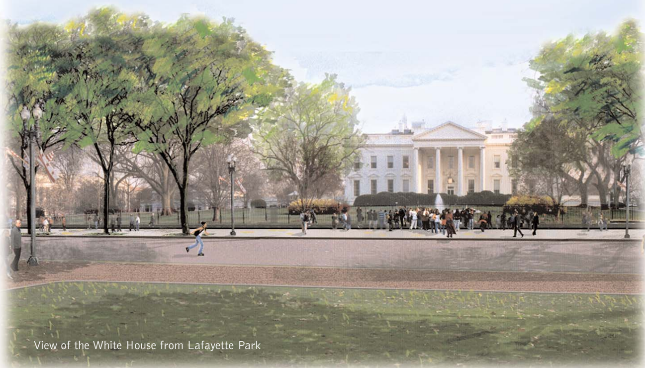
View of the White House from Lafayette Park

A dignified new civic space featuring pedestrian-friendly amenities and site furnishings now graces the famous stretch of Pennsylvania Avenue in front of the White House. The redesign of America's Main Street has transformed the Avenue from one cluttered with ad-hoc security measures to a beautiful civic area befitting one of the nation's most prominent and visited destinations.