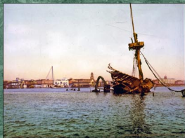
1900 Wreck of USS Maine.

The battleship USS Maine was built at the New York Navy Yard and commissioned in September 1895. Maine operated along the east coast and in the Caribbean. In January 1895, Maine arrived in Cuban waters and anchored in Havana Harbor. Cuba was a Spanish colony. USS Maine was in Havana to protect American interests due to an ongoing Cuban insurrection against the Spanish rulers. On February 15, 1898 an explosion occurred on USS Maine. The ship was destroyed and sank. There were 355 Sailors and Marines aboard and 253 were killed. The cause of the explosion, as a result of speculation in the U.S. press, was blamed on Spain. "Remember the Maine" became a rallying cry in the United States that eventually resulted in the Spanish-American War. The remains of the dead were eventually buried in Arlington National Cemetery. The hulk of Maine remained in Havana Harbor until 1912 when the wreck was raised, inspected, towed out to sea, and sunk in deep water. The two masts from the Maine were salvaged and used to erect memorials at Arlington and the U.S. Naval Academy.