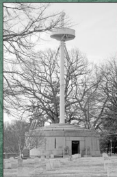
The USS Maine memorial at Arlington National Cemetery.