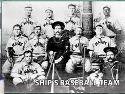
SHIP'S BASEBALL TEAM