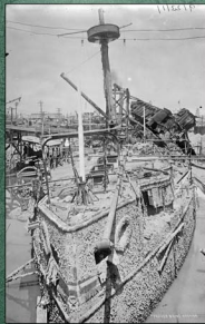
1912 The raised wreck of USS MAINE.