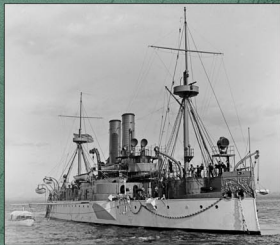
USS MAINE 1895-1898