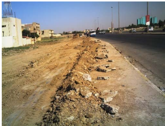
Site Photo 10. Compacted backfilled cable trench.

As the cable installation progressed, the final layers of the trench were backfilled and then compacted to meet MOE standards (Site Photo 10).