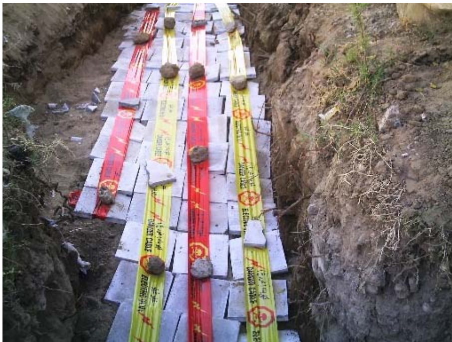
Site Photo 13. Buried cable covered with tile and warning tape.

In addition, the assessment team found the photos included in both QC and QA reports descriptive and an effective supplement to the written reports. For example, a photo attached to the QC report dated 22 June 2006 shows that the buried cable was covered with concrete tile and warning tape as required by the SOW. A photo attached to the 1 July 2006 QA report was used to verify that materials complied with requirements. As such, the USACE PE stated that he was confident in the general reliability of the QC/QA systems employed to ensure effective QM and a good end product (Site Photos 13 and 14).