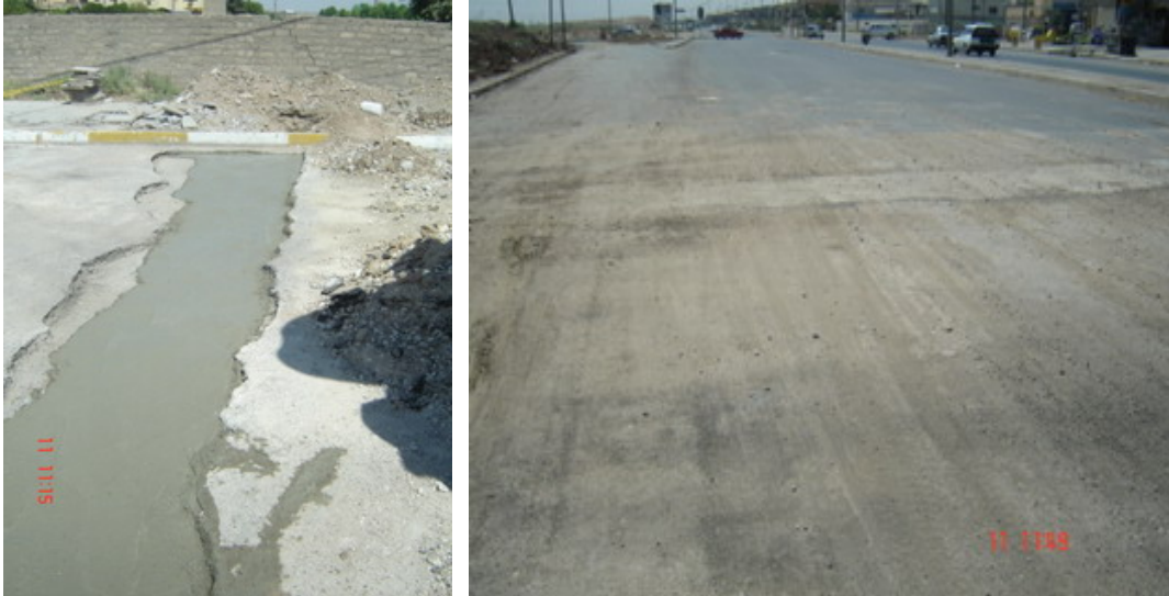
Site Photos 11 and 12. Layer of concrete is placed before being covered with asphalt. Completed cleaned trench surface.

In summary, the contractor's procedures and QM processes were reviewed and an on-site visit was conducted. At the time of the SIGIR Inspectors' site visit, the contractor had successfully installed over 9,300 meters out of 10,000 meters of cable. The Assessment Team determined that the construction met MOE standards and the construction was compliant with contract requirements.