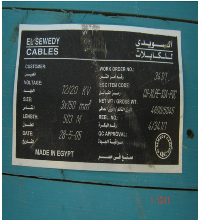
Site Photo 14. Inventory tag documents cable size and voltage rating.