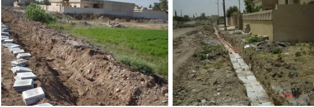
Site Photos 8 and 9. Cable covered with approved bedding material and application of cement tiles to compacted layer.

As the cable installation progressed, the final layers of the trench were backfilled and then compacted to meet MOE standards (Site Photo 10).