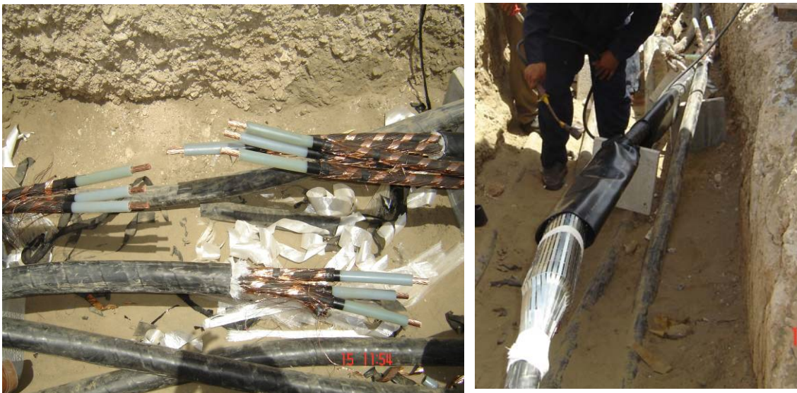
Site Photos 6 and 7. Cables spliced together with splice kit. Heat is applied to shrink outer cover.

Cables were spliced together using a shrinkable splice kit for 3x150 mm 2 , 11kV, XLPE cable. This kit includes joining components and a shrinkable outer cover that tightened when heat was applied (Site Photos 6 and 7).