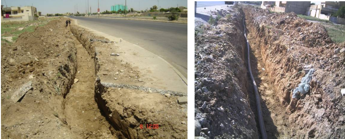
Site Photos 4 and 5. The trench is excavated, the base is compacted and the cable is positioned on the sand layer.

Cables were spliced together using a shrinkable splice kit for 3x150 mm 2 , 11kV, XLPE cable. This kit includes joining components and a shrinkable outer cover that tightened when heat was applied (Site Photos 6 and 7).