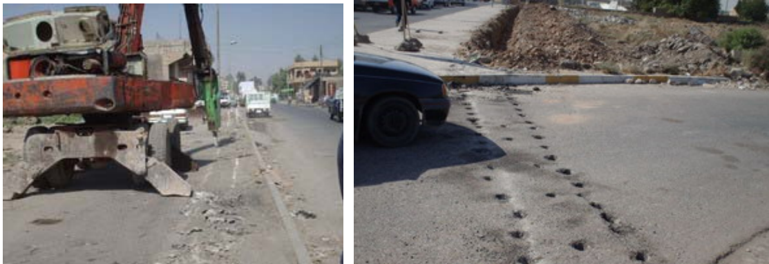
Site Photos 2 and 3. Site preparation and surface material removal

After the site location was surveyed, the surface was broken in preparation of trench excavation (Site Photos 2 and 3).