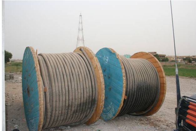
Site Photo 1. 503M 3 X 150 mm 2 Electrical Cable

The cable that was supplied met MOE standards. Specifically, the cable was a XLPE insulated 11 kV 3 X 150 mm 2 cable on 503 meter rolls (Site Photo 1).