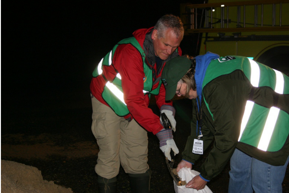
Salem County, NJ CERT members fill sandbags to protect against rising floodwaters.

The combination of high tide, a full moon, and torrential rainfall in April 2011 led to the Salem County CERT's first disaster activation. The triple threat caused some of the worst flooding in the area in 10 years. Four towns experienced significant flooding, making roads inaccessible and assistance difficult to receive. The waters rose so quickly, communities did not receive the typical advance warning and were not prepared.