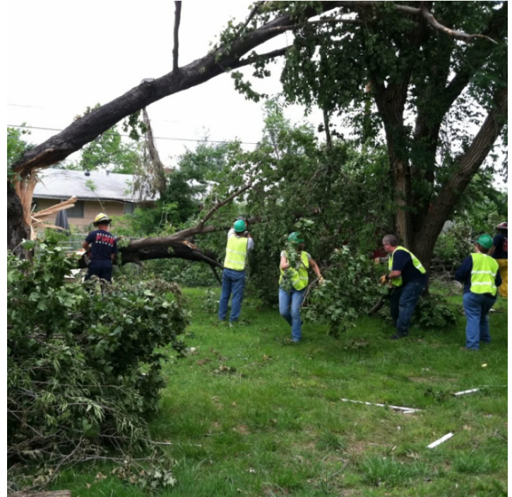
Branson, MO CERT members help clear debris after a tornado in Joplin, Mo.

On May 22, 2011, an EF5 tornado ripped through Joplin, Missouri, destroying a large swath of the community and devastating its residents. EF5 refers to the Enhanced Fujita scale used to rank tornadoes according to damage caused. An EF5 is the most severe and consists of winds greater than 200 mph.