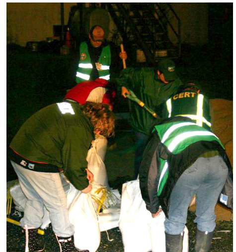
Working into the wee hours of the morning, CERT members fill 250 sandbags for Elsinboro Township, N.J.