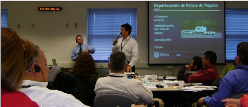
CERT training being delivered in Spanish

Recent reports from the 2010 Census show that the Spanish-speaking population of the United States has grown by almost 29 percent in the last decade. Because of this dynamic growth, many CERT programs have begun to broaden their course offerings to serve the Spanish-speaking community.