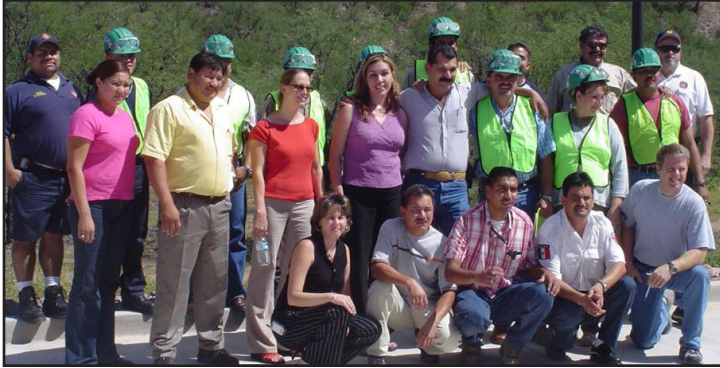
A Spanish-speaking graduating class of the Santa Cruz County, Arizona CERT