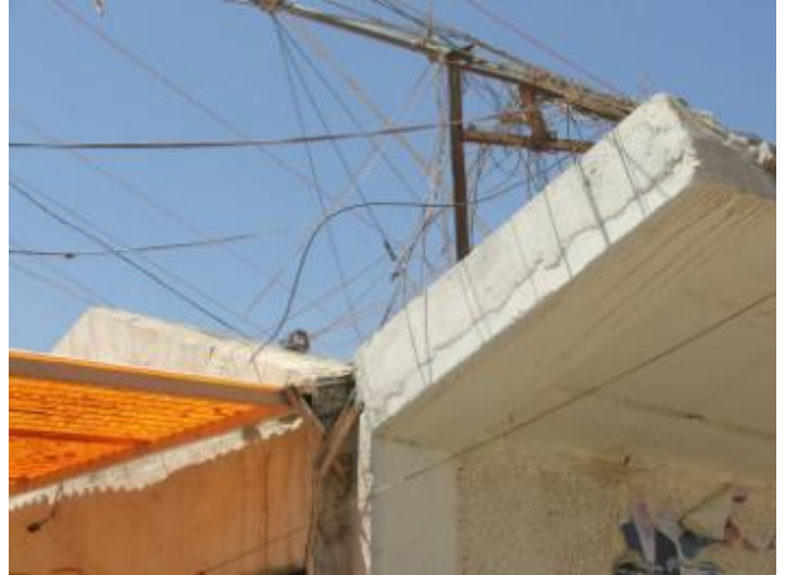
Site Photo 11. Electrical wiring connecting to system

The individual market shops had either solid steel doors or folding metal grills for security (Site Photo 12). The quality of the doors appeared to be typical of locally available materials. Several doors inspected had padlocks as required in the SOW.