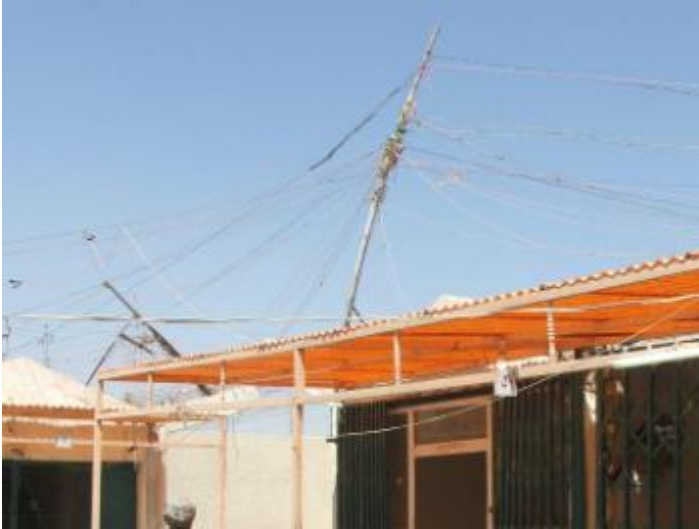
Site Photo 10. Electrical wiring without conduit