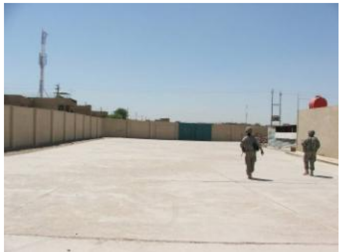
Site Photo 3. Slab at parking area