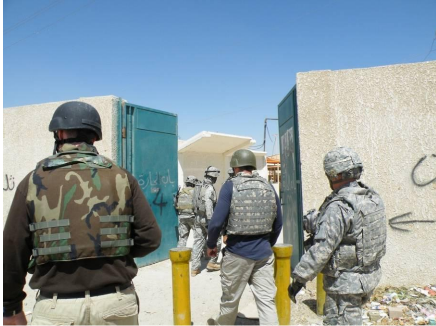
Site Photo 14. Bollards and pedestrian gate