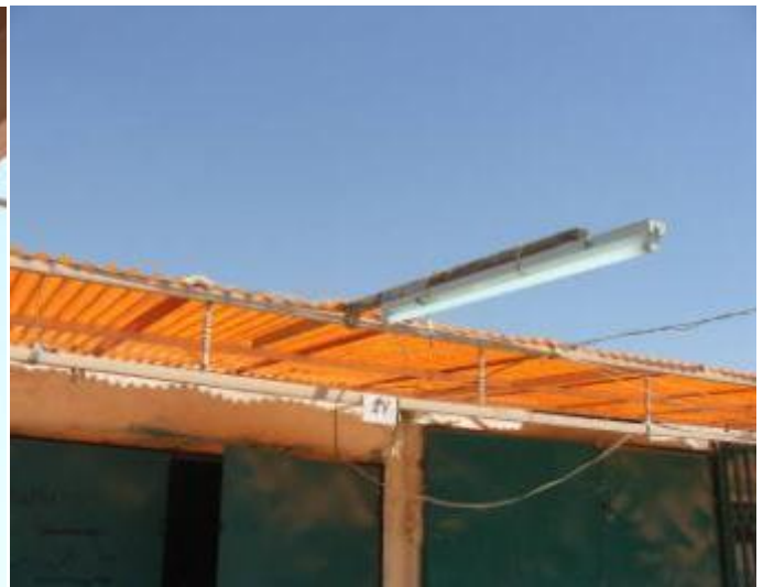
Site Photo 9. Light fixture with wooden mount