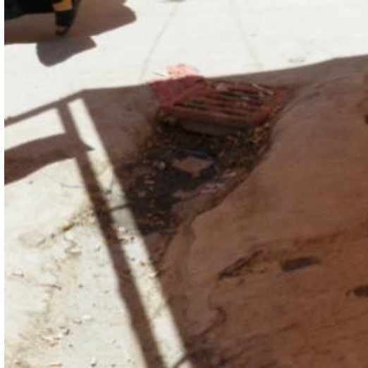
Site Photo 17. Gutter inlet

During the site visit, SIGIR identified drainage gutters in the concrete slab around the perimeter of the market courtyard. The drainage gutters consisted of a V-channel slope and allowed drainage to flow to the cast iron inlet grate (Site Photo 17). Because of time constraints, SIGIR was unable to determine whether the inlets were connected to a larger drainage system.