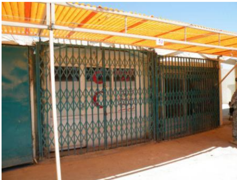
Site Photo 12. Security doors and grills

The individual market shops had either solid steel doors or folding metal grills for security (Site Photo 12). The quality of the doors appeared to be typical of locally available materials. Several doors inspected had padlocks as required in the SOW.