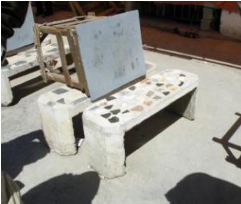
Site Photo 13. Pre-cast concrete benches

The SOW required the contractor to provide six pre-cast concrete benches for the project; however, the project file documentation lacked design information. SIGIR verified the presence of six pre-cast concrete benches on the project (Site Photo 13), which appeared to be of poor quality.