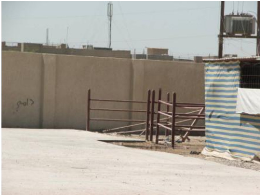
Site Photo 15. Animal corrals

The SOW required the contractor to construct six animal corrals. Because of time limitations, SIGIR was unable to physically inspect the corrals; however, SIGIR did verify the existence of some of the corrals (Site Photo 15).