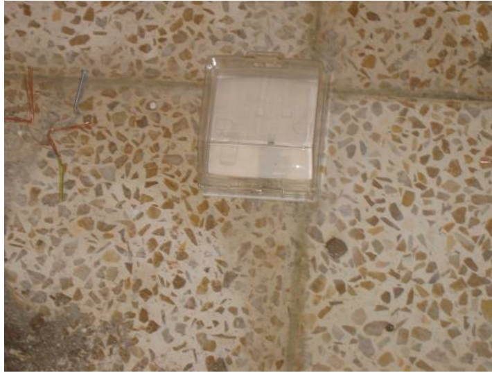
Site Photo 9. Covered electrical receptacle installed in the computer room floor