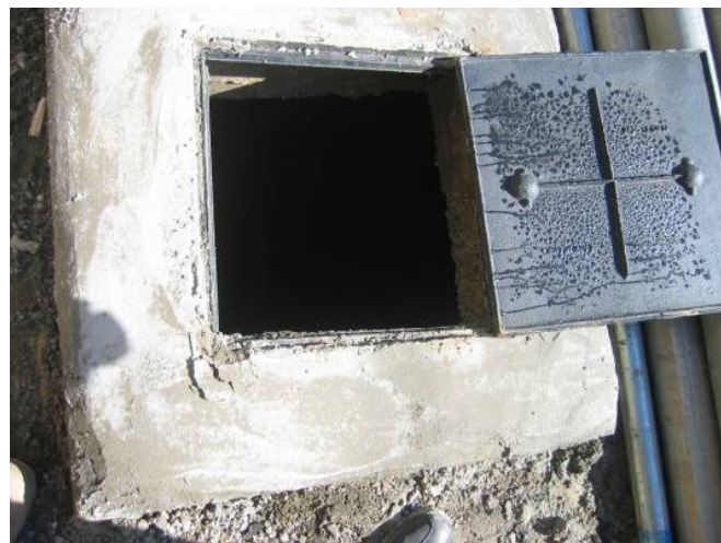
Site Photo 14. Cesspool cover