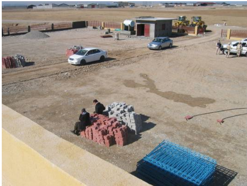
Site Photo 3. Driveway being prepared for paving stone installation

Paving stone will be used to construct walkways and driveways. Some of the driveways were being graded at the time of the inspection but stone laying had not started. Site Photos 3 and 4 show a driveway layout and stacked stone ready for installation.