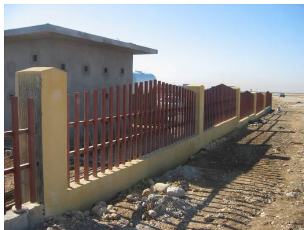
Site Photo 6. Perimeter fence segment