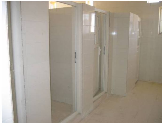
Site Photo 10. Bathroom work in progress