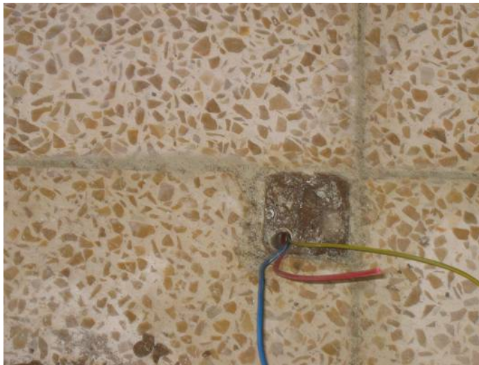
Site Photo 8. Electrical wiring routed through conduit in the computer room floor.