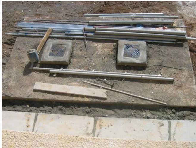
Site Photo 13. Septic tank covers