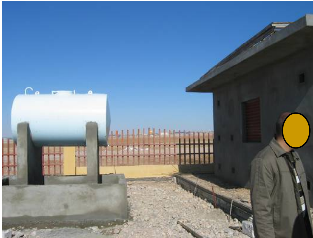
Site Photo 12. Generator fuel tank work in progress

No fire alarms, smoke sensors, or fire extinguishers were in the building nor was there a contract requirement requiring them.