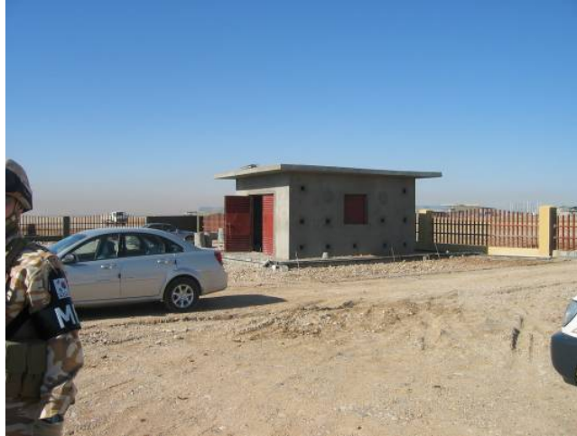
Site Photo 11. Generator house work in progress

The generator building walls and roof were under construction and the workmanship and materials were adequate. The generator floor was not yet laid and the generator was not installed. The contractor confirmed that the generator exhaust will be routed outside the building. The fuel tank installation was adequate. The fuel line to the generator house was not yet installed. Site Photos 11 and 12 show the generator house and fuel tank.