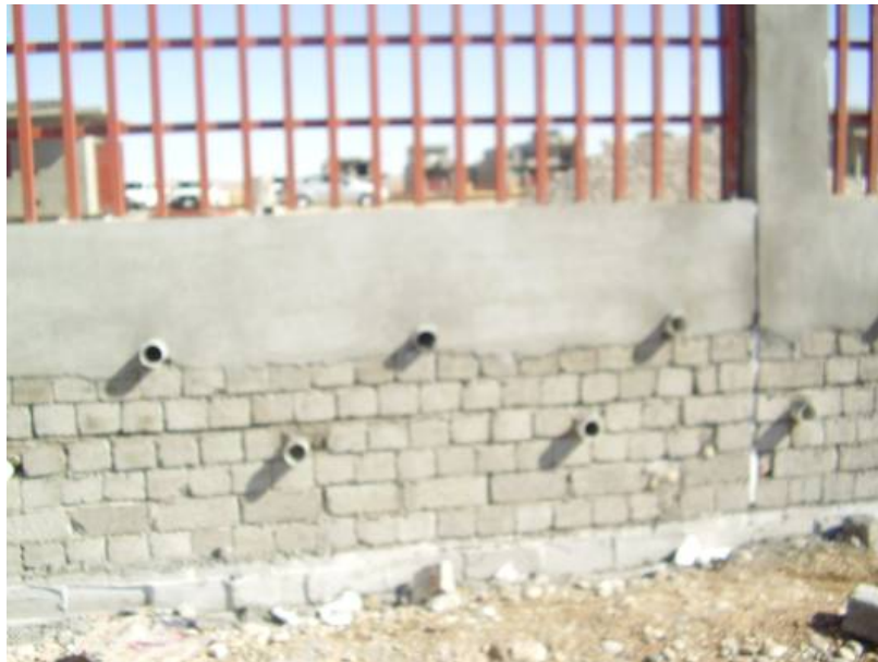
Site Photo 1. Drain pipes in perimeter retaining wall

The playground was framed by concrete blocks with two courses above ground. The area had not yet been filled with sand. The grounds were graded and sloping away from the buildings to a location near the perimeter retaining wall through which a number of drain pipes were installed. The workmanship and materials appeared to be adequate. Site Photos 1 and 2 show the grading and drain pipes in the perimeter retaining wall.