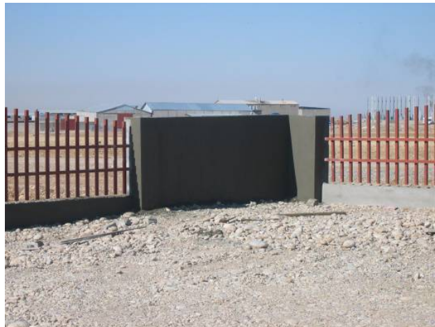
Site Photo 5. Corner segment of the perimeter fence

We observed and photographed different segments of the perimeter fence that were installed but not yet painted. The fence is made with a concrete block foundation; pillars spaced approximately 15 feet apart, and connected with vertical steel pipes approximately 2" square. The materials and workmanship appeared adequate. Site Photos 5 and 6 are examples of the perimeter fence.