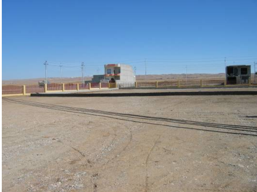
Site Photo 2. Graded facility grounds

Paving stone will be used to construct walkways and driveways. Some of the driveways were being graded at the time of the inspection but stone laying had not started. Site Photos 3 and 4 show a driveway layout and stacked stone ready for installation.