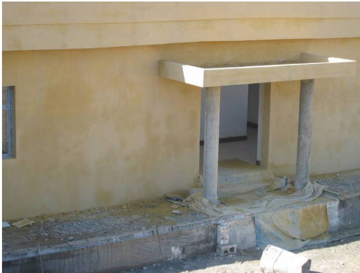
Site Photo 7. Outside finish work in progress

The single-story building was being finished at the time of the visit. Rendering and painting was partially complete and the workmanship and materials for the outside walls appeared adequate.