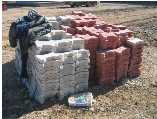
Site Photo 4. Stacked paving stones

We observed and photographed different segments of the perimeter fence that were installed but not yet painted. The fence is made with a concrete block foundation; pillars spaced approximately 15 feet apart, and connected with vertical steel pipes approximately 2" square. The materials and workmanship appeared adequate. Site Photos 5 and 6 are examples of the perimeter fence.