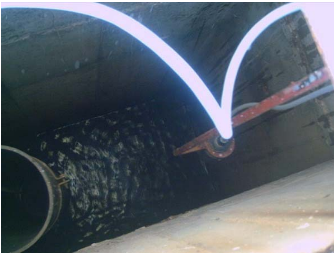
Site Photo 15. Water level indicator