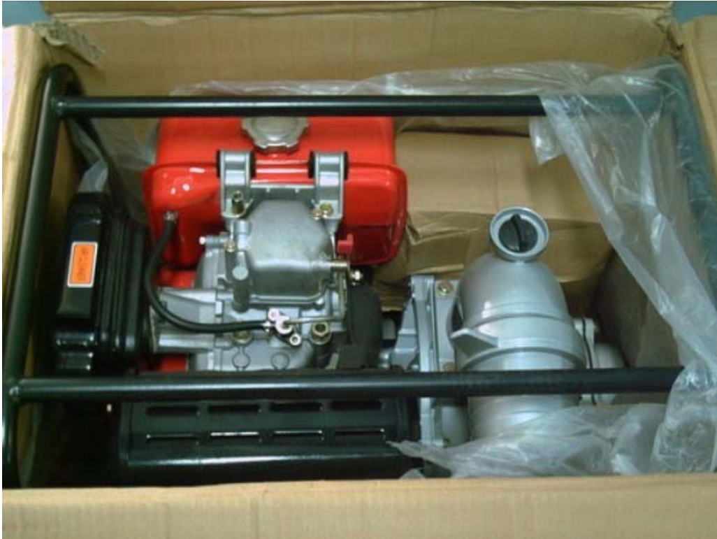
Site Photo 4. New, uninstalled gasoline pump