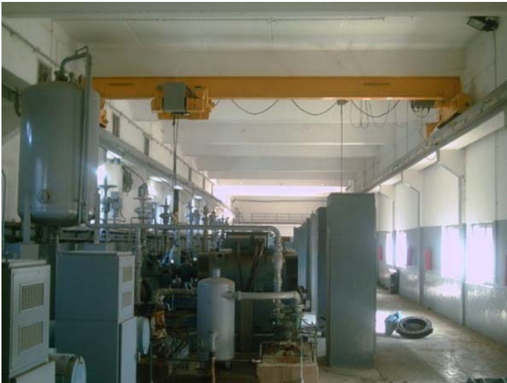
Site Photo 9. High-lift pumping station's building interior