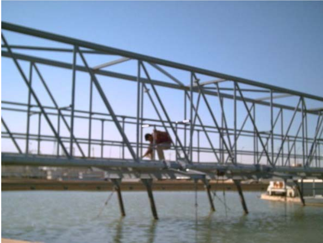
Site Photo 2. Settling tank's sludge scrapers receiving an anti-chemical paint coating of the steel parts