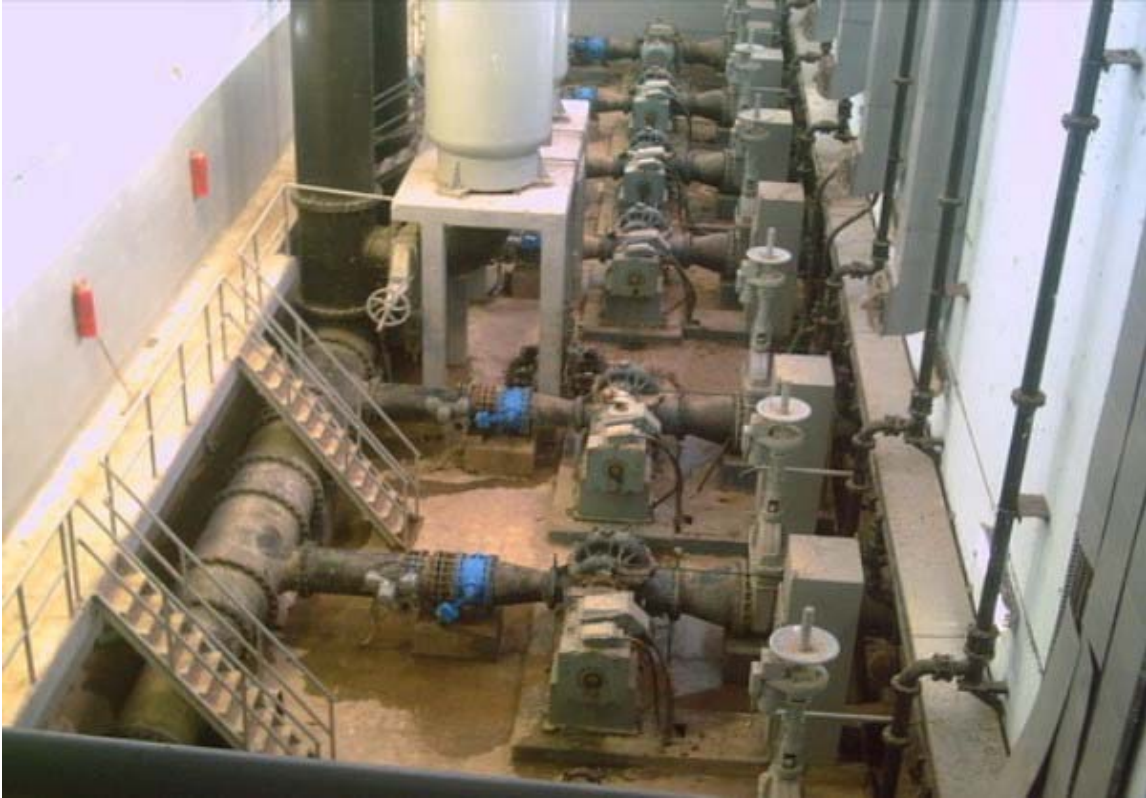
Site Photo 6. Low-lift pumping station's newly renovated interior