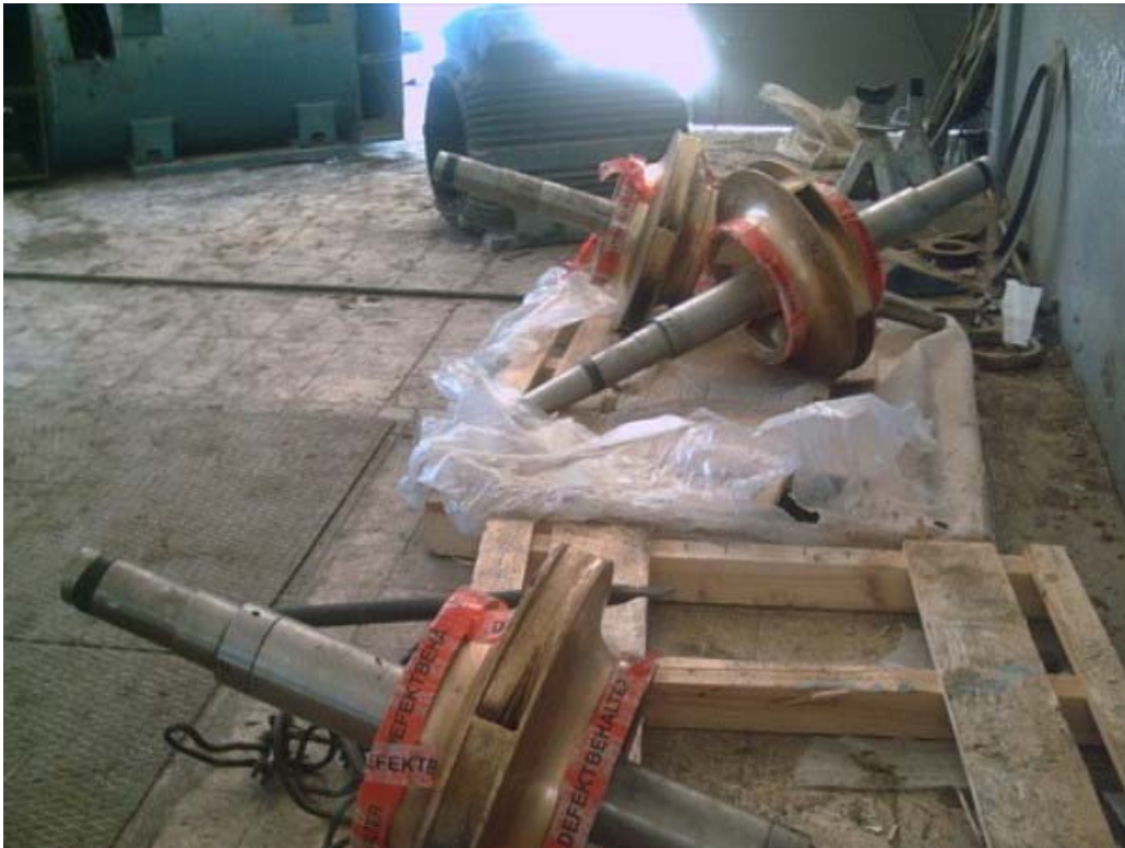
Site Photo 10. High-lift pumping station's propeller & stainless steel shaft for pumps