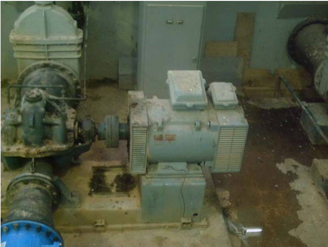
Site Photo 7. Low-lift pumping station's 180-kilowatt motor