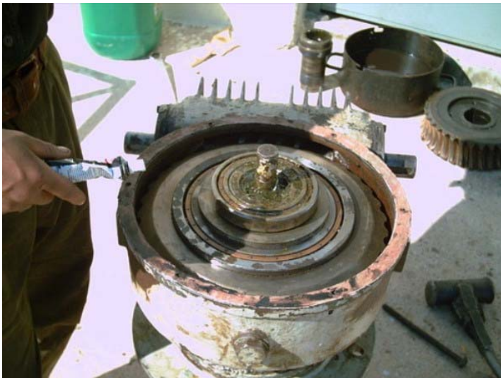
Site Photo 3. Maintenance work on flush mixers