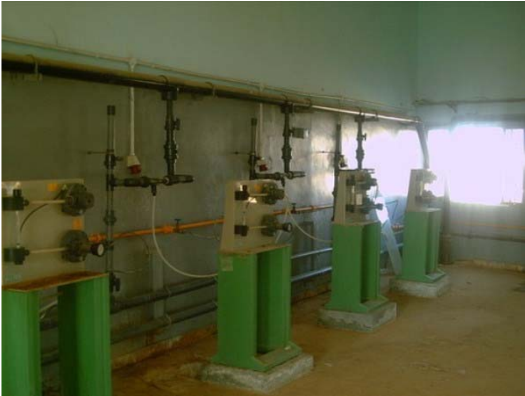
Site Photo 12. Chlorine dosing sets