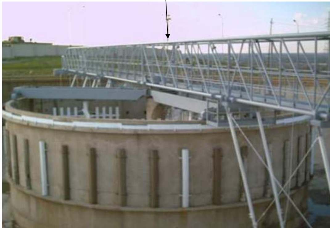
Site Photo 1. Right Bank DWTP