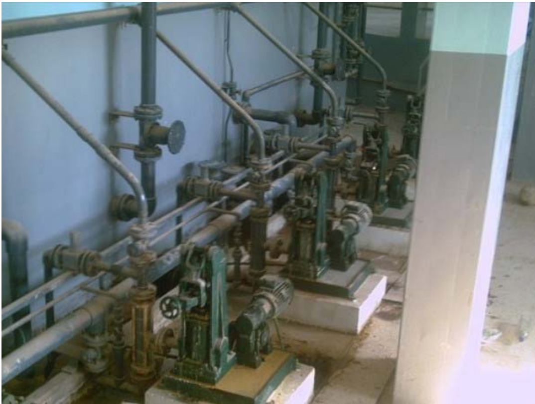
Site Photo 13. Alum mixers