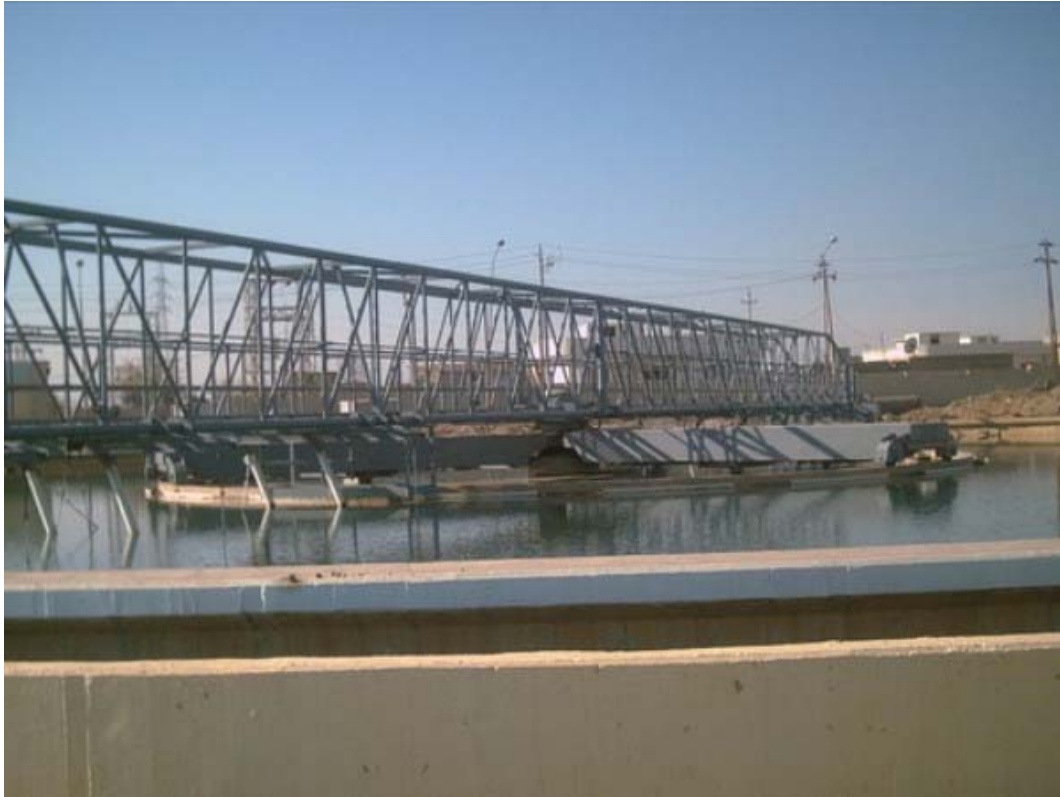
Site Photo 14. Settling tank