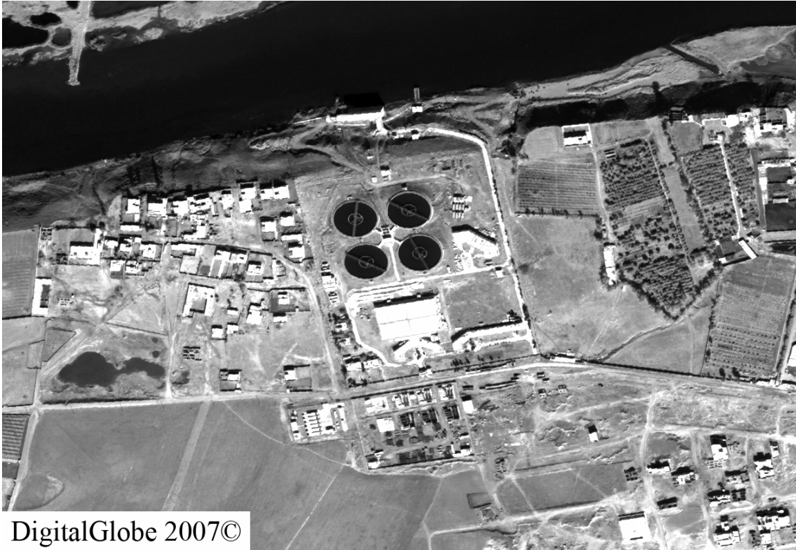
Aerial Image 1. Imagery overview of the Right Bank Drinking Water Treatment Plant taken on 27 FEB07.

Due to increased insurgent activity in the Mosul area during the two weeks that the inspection team was there, both private security contractors and the U.S. Army denied the team's requests for escort to the DWTP. Therefore, our project assessment relied solely on information obtained from the contract files and on aerial imagery (Aerial Image 1). Information contained in the contract files included the contract itself, related contract documentation, the SOW, the design package (drawings and specifications), quality control reports, quality assurance reports, construction progress photos, the final situation report, invoices, submittals, and closeout documents.