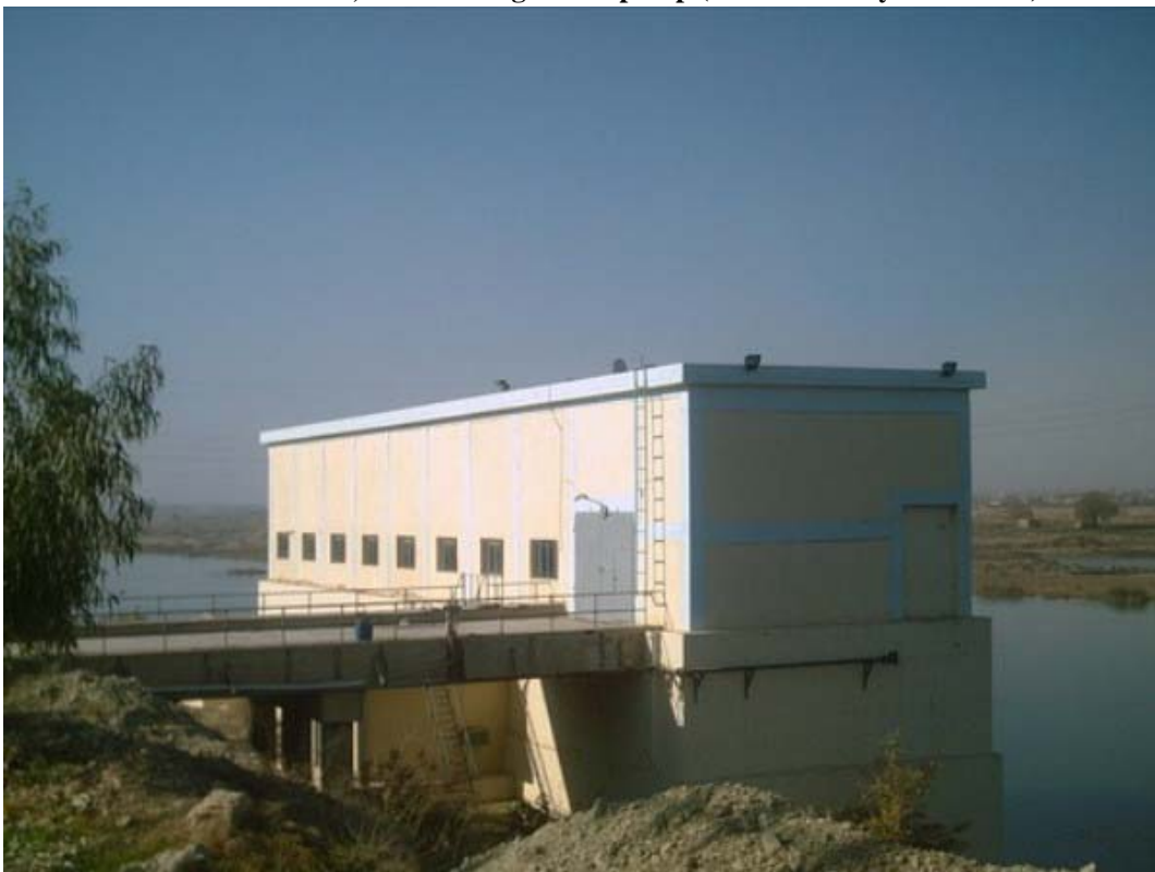
Site Photo 5. Low- lift pumping station's newly renovated exterior