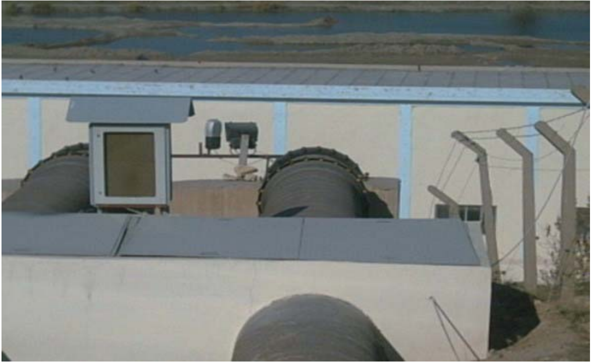
Site Photo 8. Low-lift pumping station's flow meter