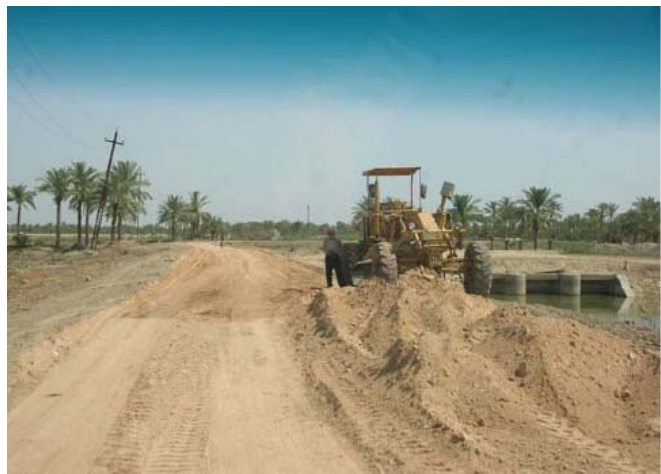
Site Photo 2. Fill material being leveled.

There was one area of concern noted by the assessment team as shown in Site Photo 3. The material utilized to construct the fill section appears to contain organic matter. The Iraqi Standard Specifications for Roads and Bridges notes that soil containing more than 12 percent organic matter (as tested by British Standard 1327) is unsuitable. The contract files did not contain any record of tests for organic