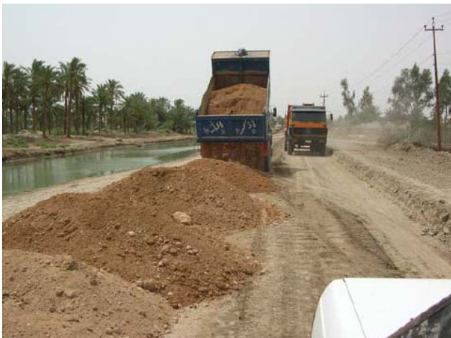
Site Photo 1. Trucks delivering material to the roadway

The BOQ required the contractor to place 95,000 m 3 of fill material. Although, we were not able to verify quantities, we reviewed USACE Quality Assurance (QA) reports to determine the adequacy of the earthwork in constructing the fill sections along the 7.1 km roadway. Based on our review, the earthwork construction appeared to meet the requirements of the contract. The material stockpiled along the roadway prior to placement appeared capable of being compacted to form a stable fill area with side slopes as shown in Figure 2. Site Photos 1 and 2 show the material stockpiles used to construct fill sections. Site Photo 1 shows a dump truck placing material along the roadway. In Site Photo 2 a motor grader is leveling the material prior to compaction.