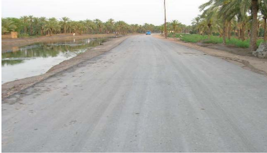
Site Photo 10. Straight section of Thi Qar Village road in April 2006.