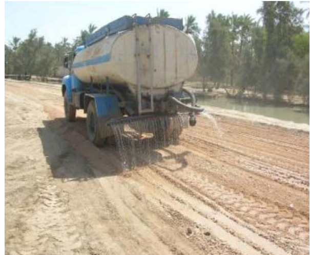
Site Photo 5. Watering the sub-base.