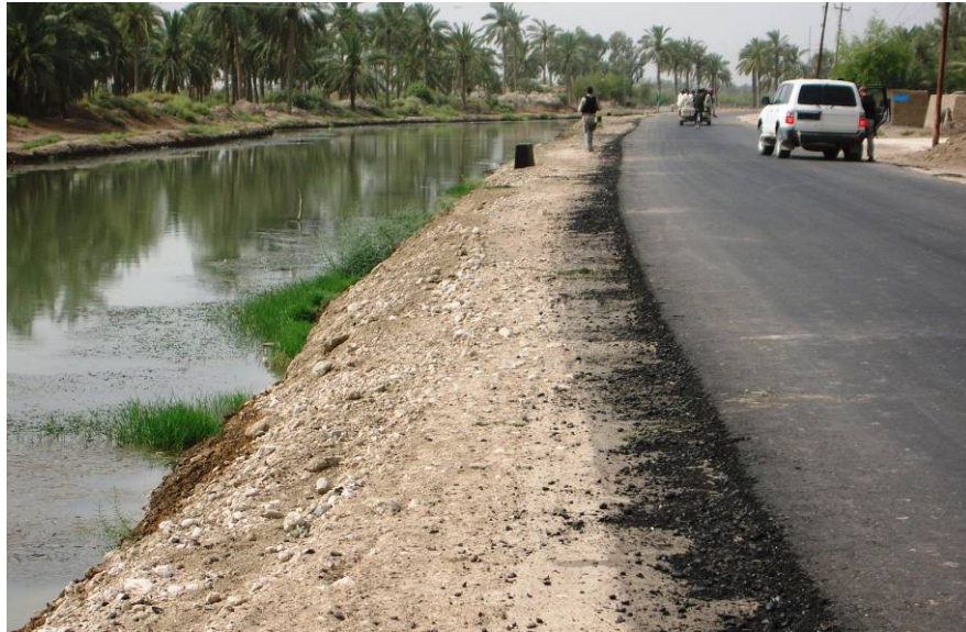
Site Photo 8. Outside pavement edge with a non-uniform edge.

In addition to reviewing the QA reports, the USACE Resident Office in April 2006, dispatched an Iraqi local national QAR to the project site to inspect the Thi Qar Village Road, and take pictures showing current conditions. The assessment team reviewed the photos taken by the USACE QAR and the condition of the pavement appeared to be in satisfactory condition, except for some mud on the road. The photos did not reveal any surface deficiencies such as cracking, rutting, raveling, or potholes. The minor discrepancies noted during the inspection process do not appear to have adversely affected the overall condition of the road. Site Photos 9 and 10 show the condition of the Thi Qar Village Road in April 2006, approximately 9 months after completion.