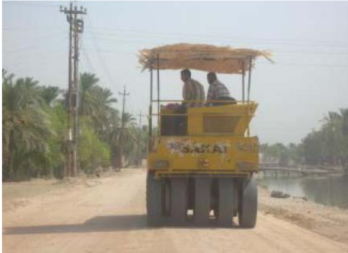
Site Photo 4. Rolling operations to compact sub-base.