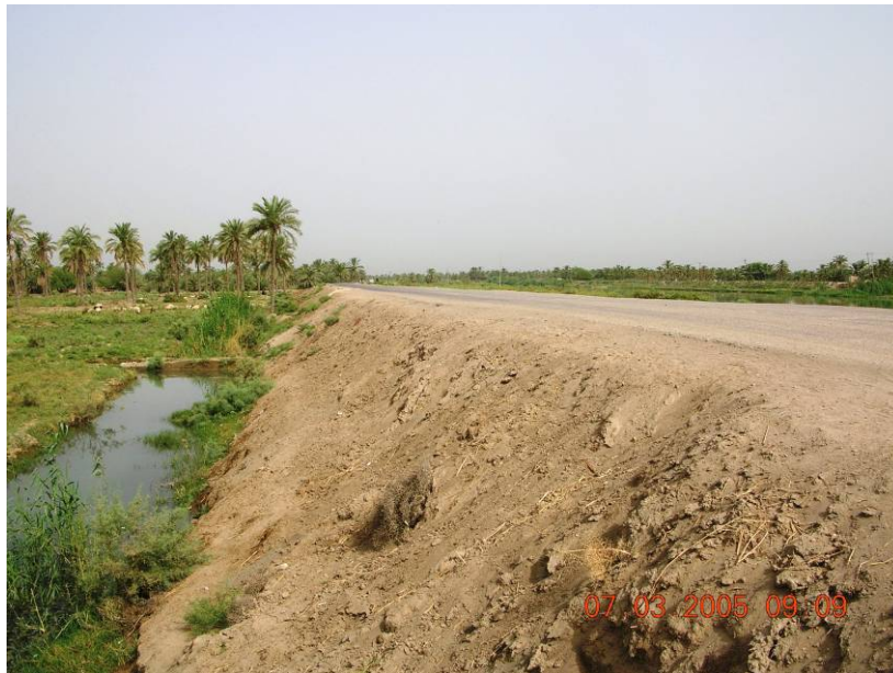
Site Photo 3. Embankment with organic matter in the fill.

matter, so it is unclear whether the amount of organic matter in the embankment shown in Site Photo 3 exceeds the 12 percent threshold. Based on subsequent photographic evidence, the effects of the organic material appear to be insignificant.