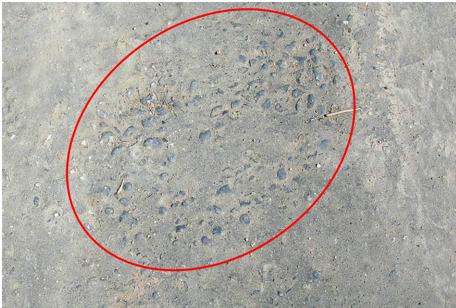
Site Photo 7. Exposed aggregate on surface of asphalt base course.

construction. The USACE RE indicated on 17 July 2005, that within the first 500-750 meters of the project from the railroad station ( the southern limit of the project ), the asphalt appeared to have too much aggregate on the top layer (Site Photo 7).