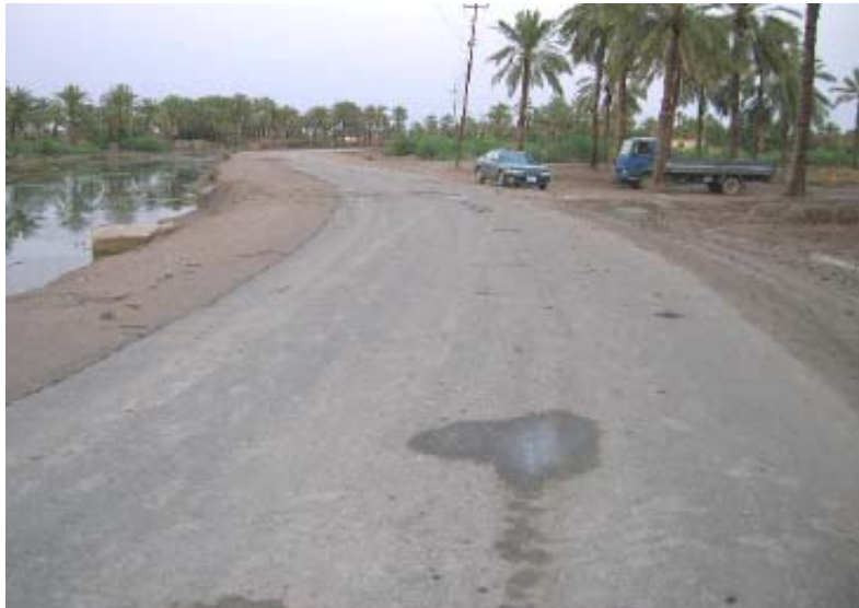
Site Photo 9. Curved section of Thi Qar Village road in April 2006.

In addition to reviewing the QA reports, the USACE Resident Office in April 2006, dispatched an Iraqi local national QAR to the project site to inspect the Thi Qar Village Road, and take pictures showing current conditions. The assessment team reviewed the photos taken by the USACE QAR and the condition of the pavement appeared to be in satisfactory condition, except for some mud on the road. The photos did not reveal any surface deficiencies such as cracking, rutting, raveling, or potholes. The minor discrepancies noted during the inspection process do not appear to have adversely affected the overall condition of the road. Site Photos 9 and 10 show the condition of the Thi Qar Village Road in April 2006, approximately 9 months after completion.