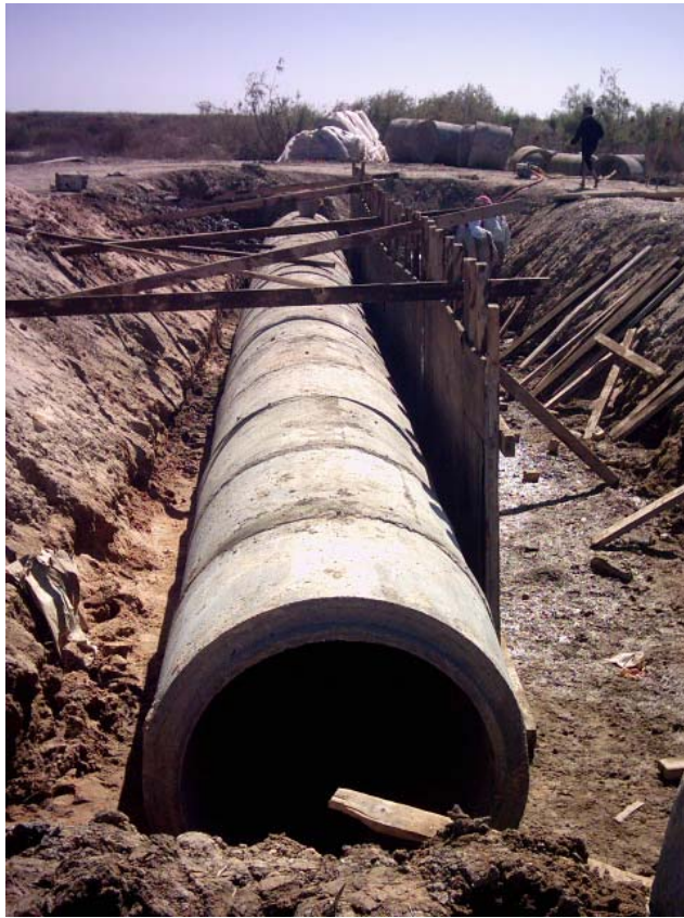
Site Photo 11. Reinforced concrete pipe culvert under construction.