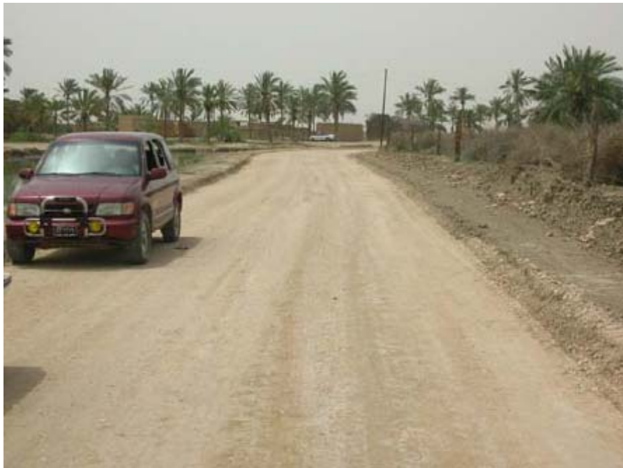
Site Photo 6. Compacted sub-base.