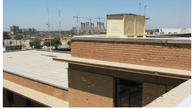
Site Photo 17. Roof top galvanized water tank

The design showed hot water being supplied to the bathrooms from the basement. However, the design did not show the source of the hot water in the basement, nor hot water piping from the source to the bathrooms. While inspecting the basement, the contractor's representative did show us two heat exchangers, which according to the contractor supplied hot water for the bathrooms.