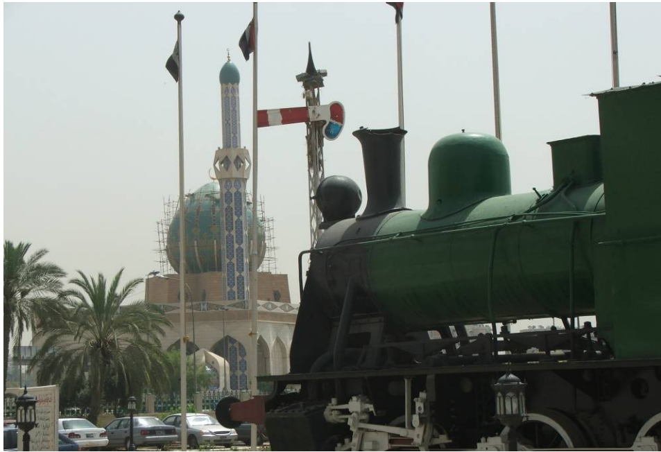
Site Photo 2. View of original railway car displayed in front of Baghdad Railway Station