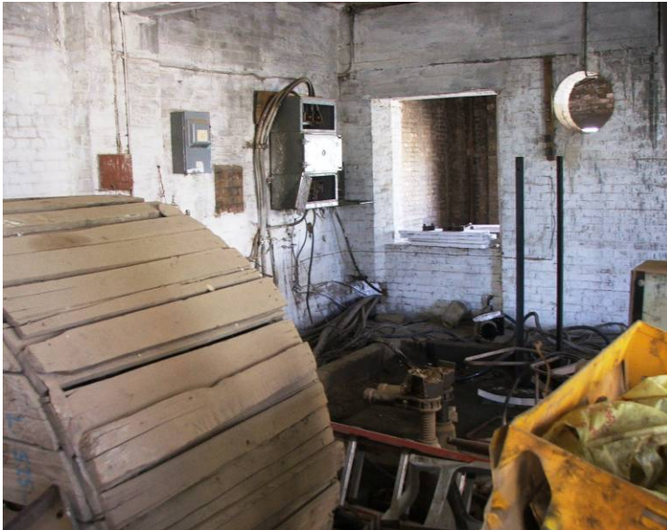
Site Photo 26. Substation building on east side of rail station

When the primary feeder to the station's powerhouse goes down, the railway station utilizes the second feeder. To connect the second feeder to the railway station, one of the station's employees operates a switch manually. Site Photo 27 shows the manual throw switch shown in the open position. A new second feeder (in the pending modification) would bypass the old substation all together and be routed from the west side of the station, through the utility tunnels into the powerhouse on the east side of the station.