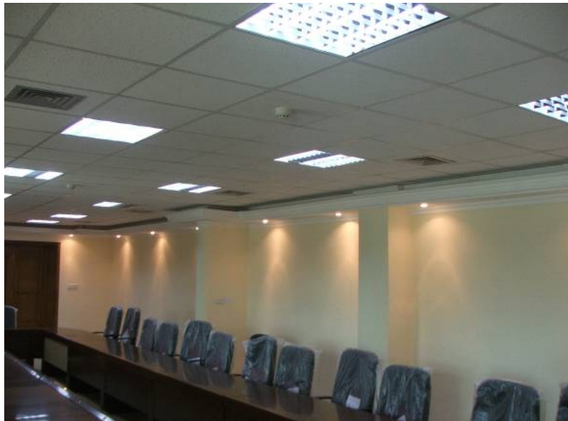
Site Photo 13. Conference room with suspended acoustical ceiling

The BOQ and design required the repair of masonry walls and exposed concrete ceilings. In addition, the BOQ listed a requirement for the painting of masonry walls and ceilings with a primer coat and two finish coats. The design originally required suspended acoustical ceiling in the main corridors of the rail station. However, the acoustical ceiling in the corridors was eliminated from the design requirements. Suspended acoustical ceilings were installed in the bathrooms and in the main conference room (Site Photo 13) on the first floor of the building. In the corridors, the contractor repaired (as needed) and repainted the existing gypsum suspended ceiling and in the offices, the contractor repaired (as needed) and painted the existing concrete ceiling.