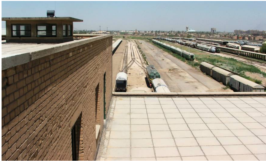
Site Photo 10. One section of the repaired roof

provided by the USACE DRE, we did not see any problems associated with the workmanship or final product. Site Photo 10 shows the roof after repairs.