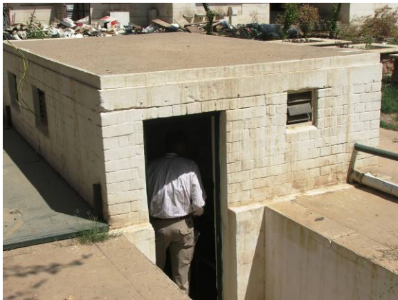
Site Photo 19. One of the two sewage pump houses

At the time of the assessment, the issue had not been resolved, but the DRE, PCO, and representatives of IRMO were meeting to address punch list items, pending modification work, and the issues raised in the contractor's letter.