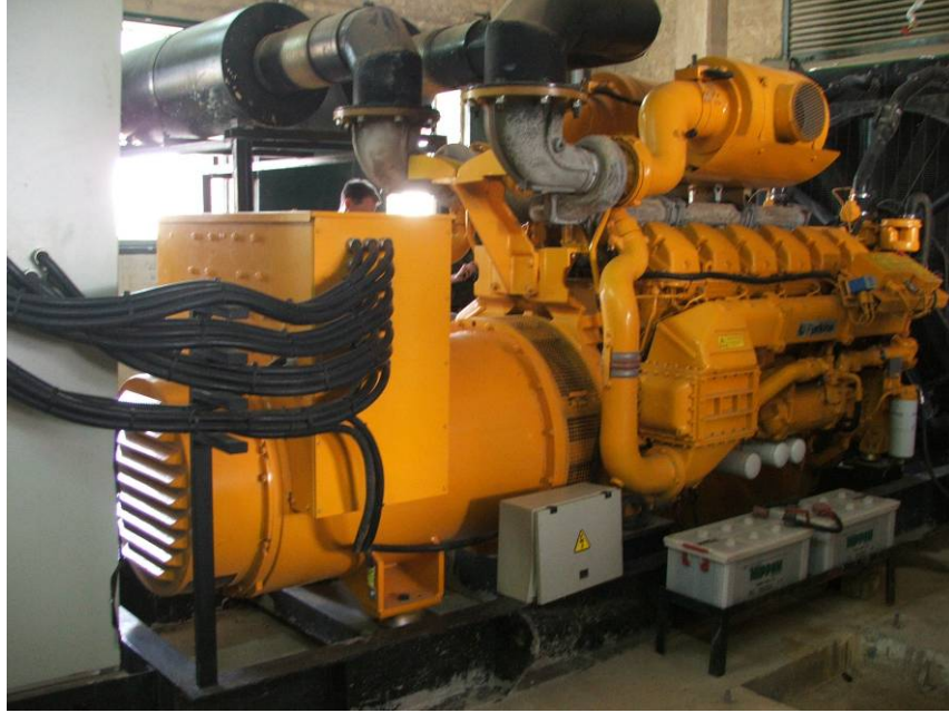
Site Photo 25. One of two Perkins 1,250 KVA generators

We did not observe the generators operating on either of the two site visits when we toured the powerhouse. However, power from the city grid is not reliable, and the generators have operated on a routine basis since their installation. The final punch list does not list deficiencies associated with the generators themselves, although there remain some issues associated with how they are operated.