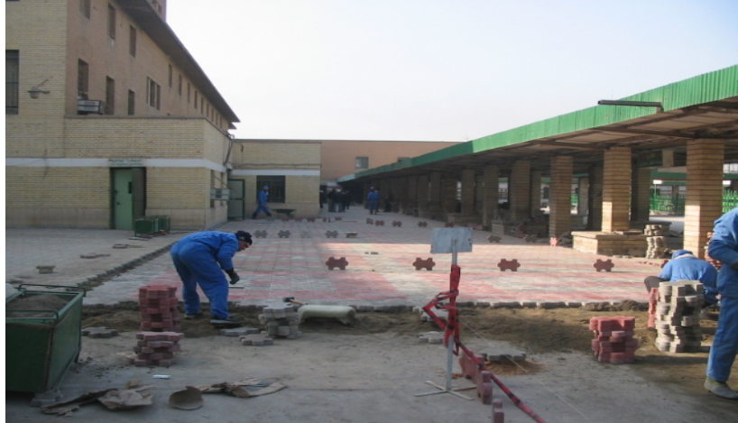
Site Photo 5. Work in progress on passenger waiting platform