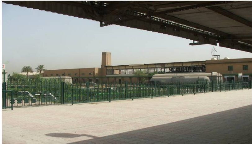
Site Photo 6. Completed concrete pavers on the platform