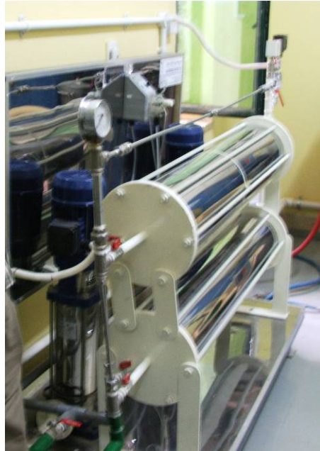
Site Photo 18. Pressure vessels containing filtration units on the RO system

For drinking water, the contractor installed drinking water dispensers in every floor in each wing. To treat the drinking water, the contractor installed a reverse osmosis (RO) purification system in a utility room on the ground floor. The BOQ included a requirement for one RO purification system for drinking water. However, the design did not show the RO system location or piping diagrams from the system to the drinking dispensers. Site Photo 18 shows one part of the RO system, the pressure vessels containing the thin film membrane elements.