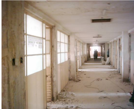
Site Photo 11. View of existing interior partitions

interior partitions with aluminum partitions consisting of MDF and reinforced glass. The observed partitions appeared to meet the standards of the design.