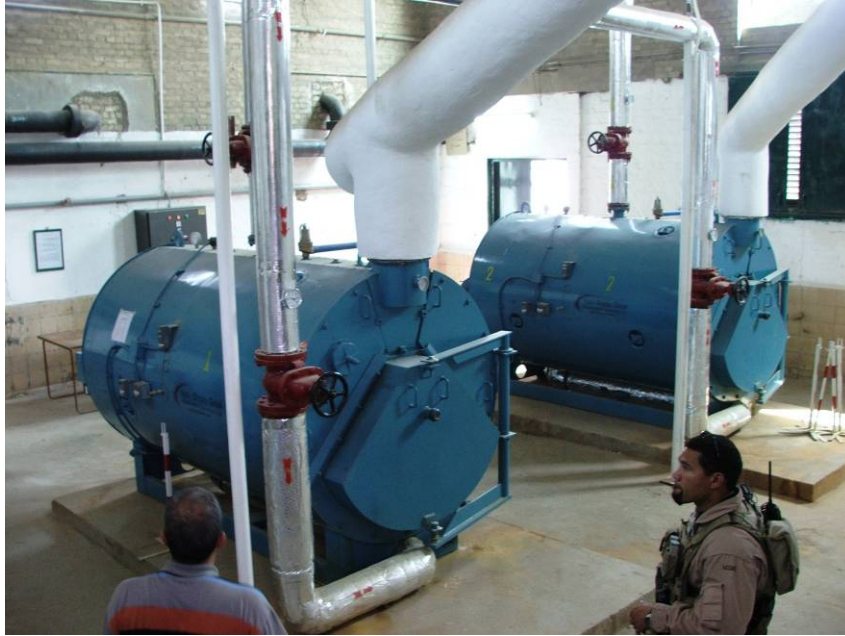
Site Photo 24. York Shipley hot water boilers

The assessment team verified their installation as well as the required water softener, and hot water circulation pumps. We did not notice any apparent defects with the boilers or the supporting equipment, including evidence of prior leaks. The insulation on the hot water pipes also appeared adequate, with no noticeable defects.