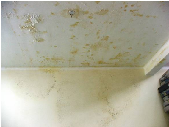
Site Photo 14. Water damage to ceiling caused by rainwater leakage from above

above contained a restaurant (Site Photo 15) that had been looted prior to the project and was exposed to the elements. Thus, rainwater trapped in the old restaurant leaked into the room below. The renovation scope of this project did not include the restaurant.