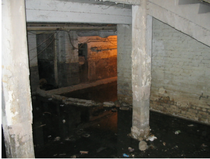
Site Photo 3. View of basement prior to rehabilitation and drainage of sewage