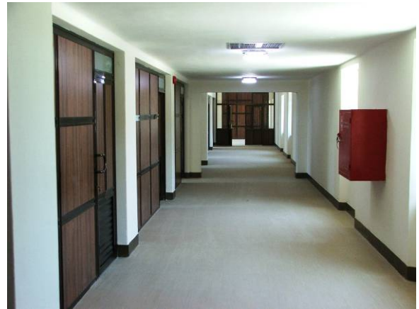
Site Photo 12. View of new interior partitions