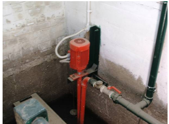
Site Photo 20. One of two electrical sewage pumps in the pump house

The SOW included the renovation of the bathrooms at the railway station. The design and BOQ required replacement of all bathroom plumbing and fixtures, ceramic tile wall and floor tile, electrical lights and outlets in all bathrooms. According to the design drawings the renovation scope included approximately 31 bathrooms in the railway station. The bathrooms ranged in size from those with two eastern toilets and two wash basins to larger bathrooms with four eastern toilets and four wash basins.