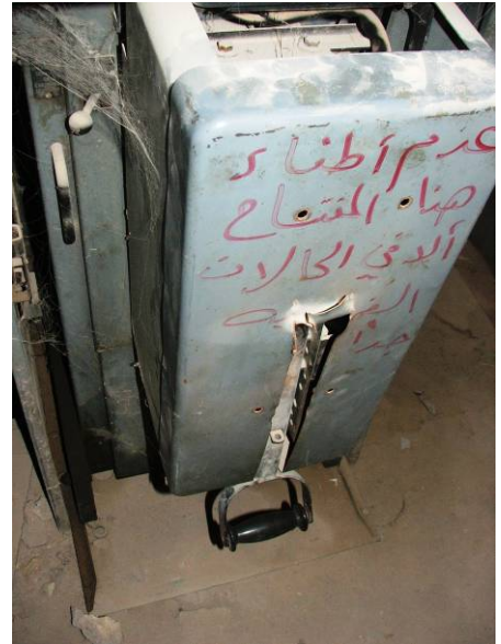
Site Photo 27. Manual electrical switch