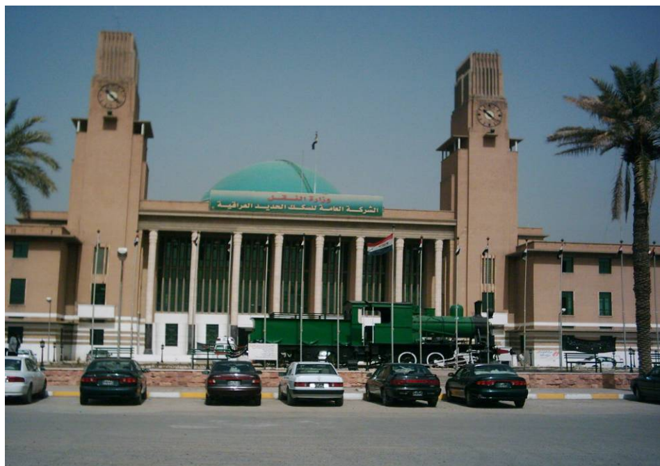
Site Photo 1. View of outside of Baghdad Railway Station

IRMO estimates a loss of $17.5 million per week to the Iraq economy because of the inability to transport goods by rail. Further, the inability to move bulk goods produced in Iraq by rail (oil, grain, cement, and fertilizer) is significantly impacting Iraq's ability to produce and export these goods to global markets.