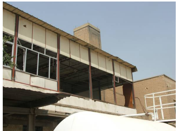
Site Photo 15. Old restaurant exposed to weather resulting in leaks below

The areas containing suspended acoustical ceilings that we observed appeared to be installed correctly. We did not find any noticeable defects, except in one bathroom where water leakage from the bathroom on the floor above resulted in damaged ceiling tiles. The leakage in the bathrooms will be discussed later in the report.