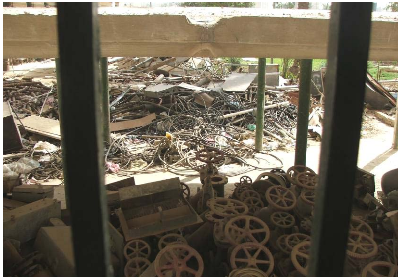
Site Photo 9. View of old parts located on site

The demolition and clean-up portion of the contract was de-scoped. During our site visit, we identified old parts and miscellaneous equipment that were removed from the basement (e.g., valves and electrical cable) and stored on site adjacent to the east side garden area. According to the USACE DRE, the IRR wants to retain the equipment to resell it for revenue at a future auction. Site Photo 9 shows the excess material.