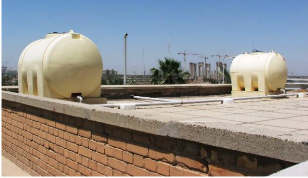
Site Photo 16. Roof top polyethylene water tanks