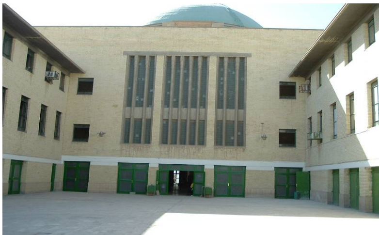
Site Photo 28. Rear view of railway station – site of future canopy

wants to have done. At the time of the assessment, these issues have not been resolved, but the parties have been meeting to resolve them.