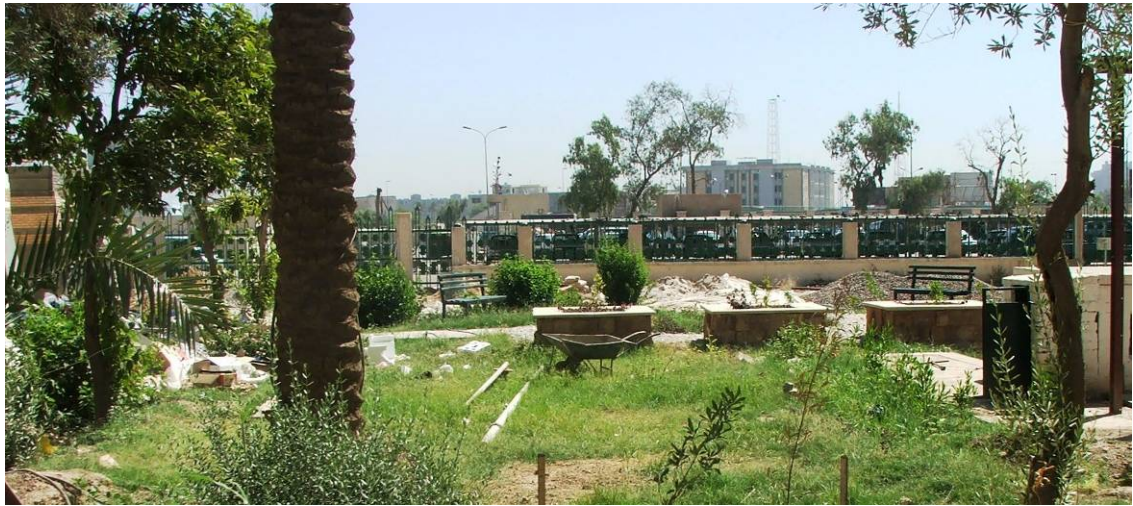
Site Photo 8. Garden area on east side of the railway station