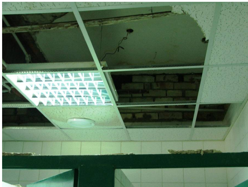
Site Photo 22. Water damage to the suspended ceiling

At the time of the assessment, the USACE DRE and contractor were working to develop a solution that would eliminate the standing water while satisfying the requirements of the IRR.