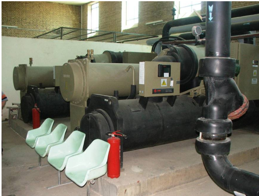
Site Photo 23. Two, 500 ton chiller units

The design also required two chilled water pumps (flow = 252 m 3 /hr) for pumping chilled water from the chillers to the air handling units in the railway station and two condensing water pumps (flow = 364 m 3 /hr) for pumping condensing water from the chillers to the cooling towers. During the site visits, the pumps were in place and operating. We did not observe any deficiencies associated with the pumps, piping, and valves, including any evidence of leaks or loose connections.