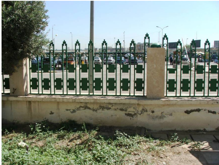
Site Photo 7. Fence on east side of station near garden area

The fence design drawing provided to the assessment team showed 10 gates, although we did not verify the quantity nor did we inspect them.