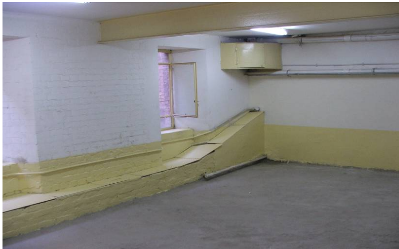
Site Photo 4. View of basement after drainage, waterproofing, and painting